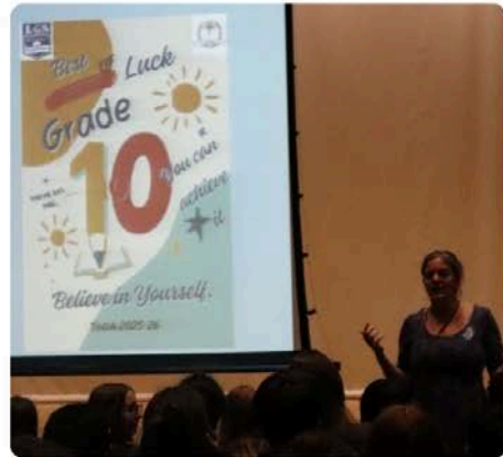
Grade 10 Assembly 21st Apr 2026