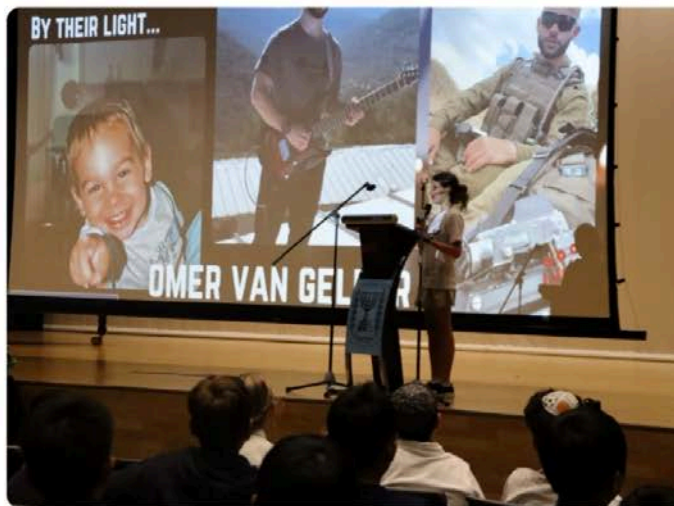
Yom Ha'Zikaron 21st Apr 2026