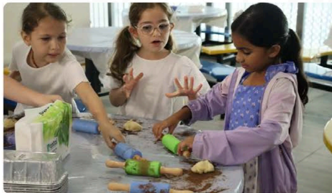
Yom Ha'Atzmaut 22nd Apr 2026