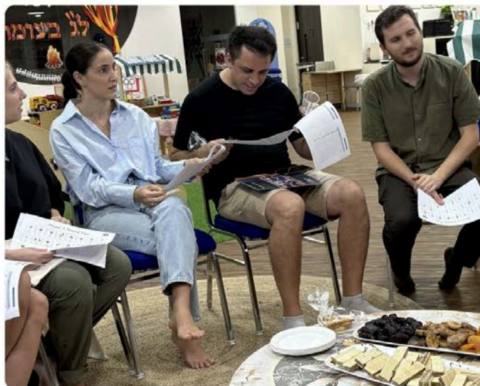
SMMIS @ Ganenu: Growing Lifelong Readers 28th Apr 2026