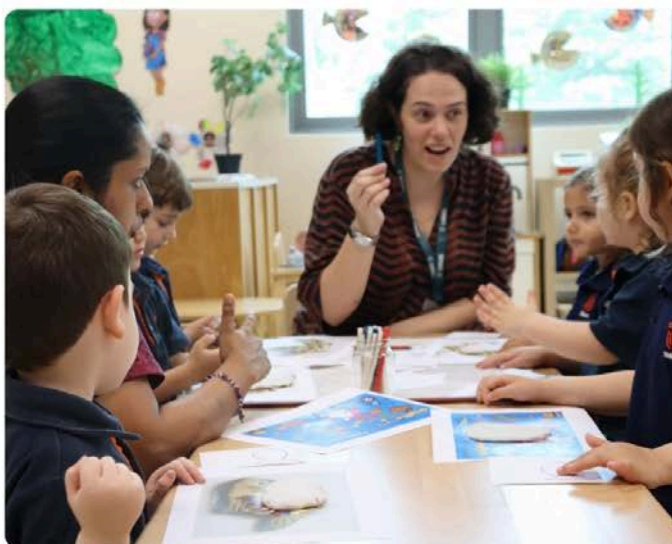
Nursery Clay Making 29th Apr 2026