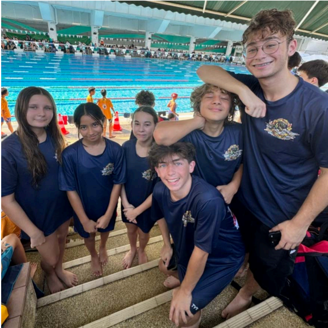
Dragon's Den Swimming Competition @ UWC East