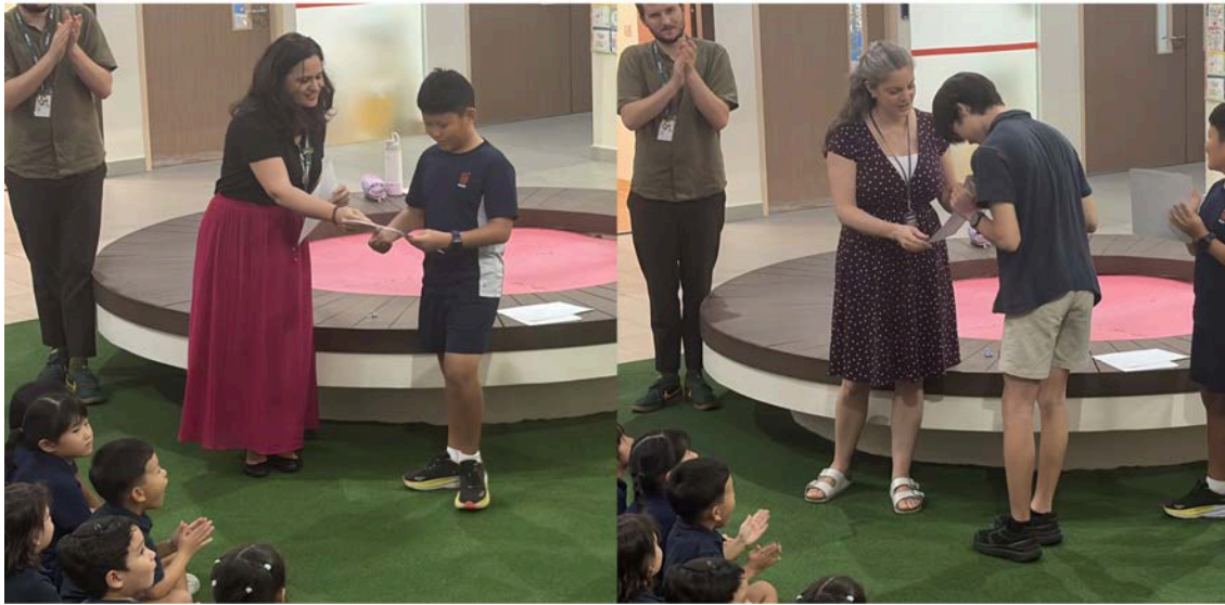
Winner Announcement: Poetry By Heart 2026