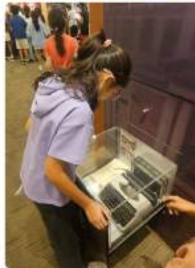
G4 Field Trip to Singapore Parliament House 6th May 2026