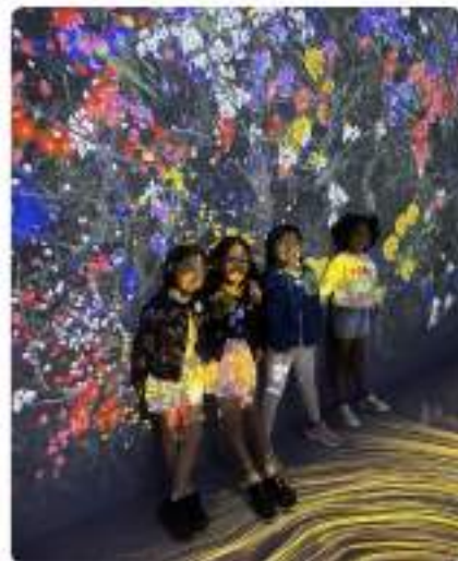
G1 Field Trips to Singapore Art Science Museum 6th May 2026