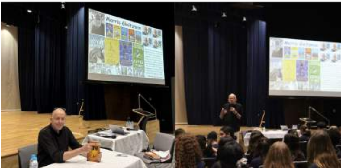
Author Talk: Morris Gleitzman 4th May 2026