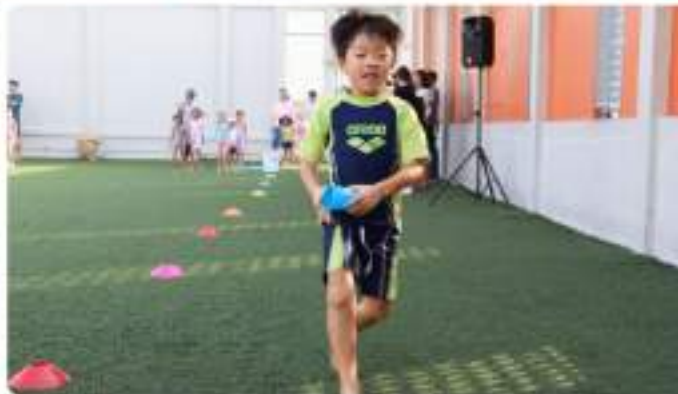
Nursery - K2 Sports Day 7th May 2026