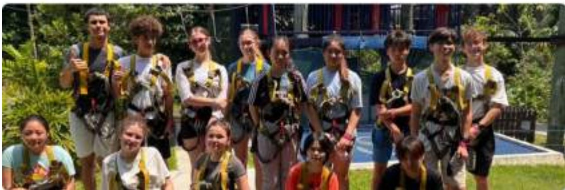
Secondary School Reward Trips 20th May 2026