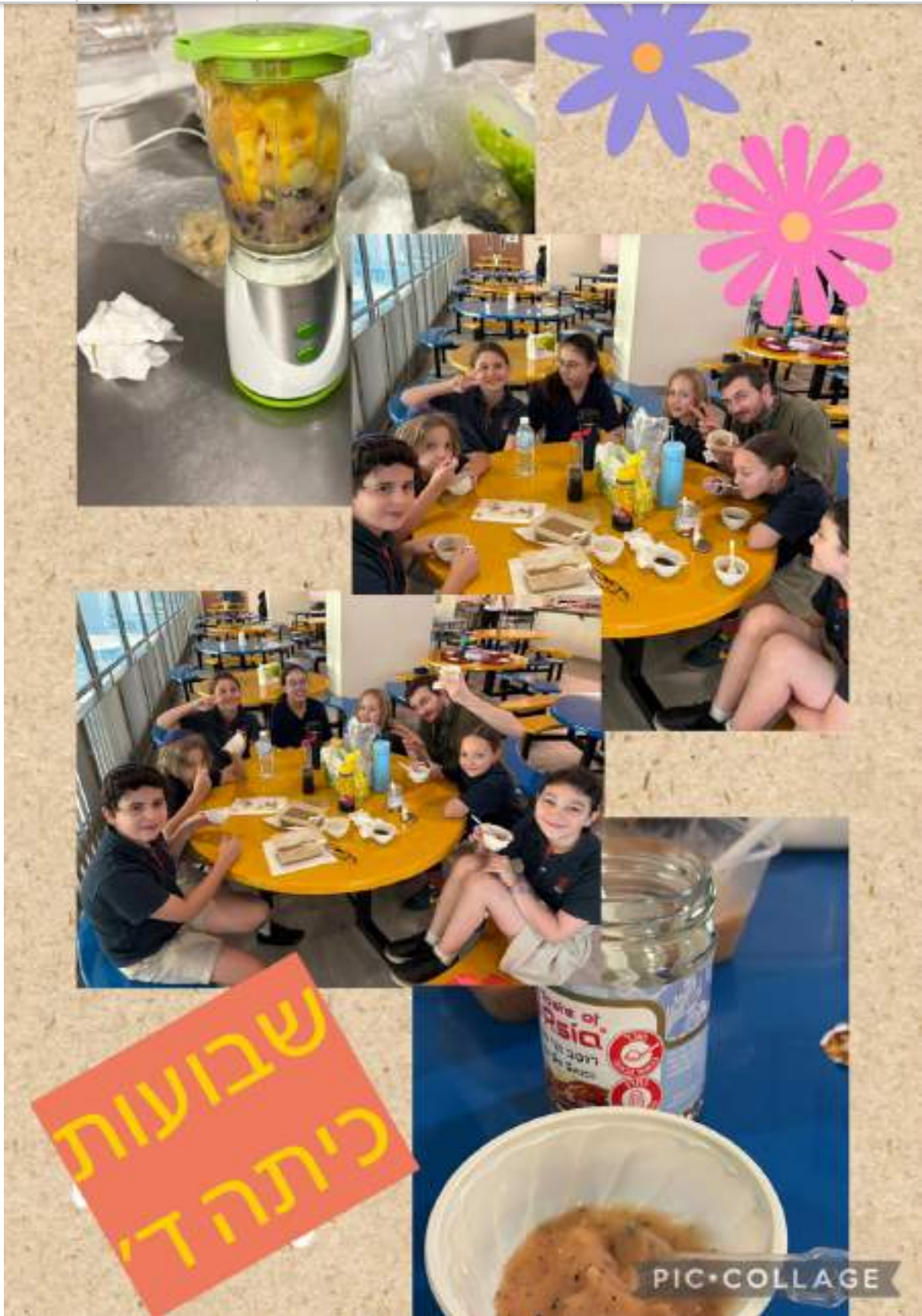
Shavuot Celebration 20th May 2026