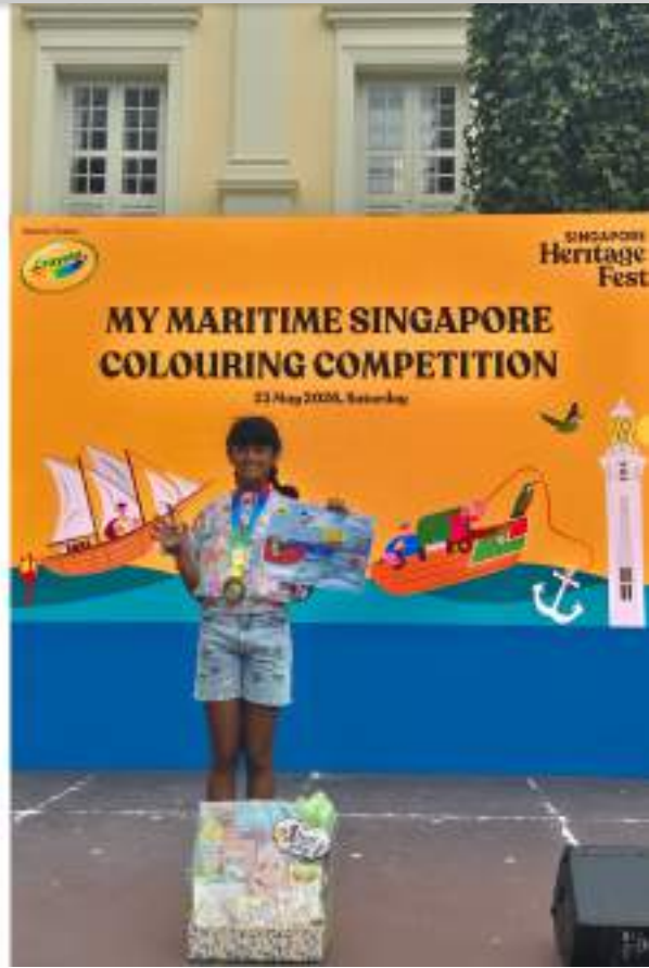
My Maritime Singapore Colouring Competition 23rd May 2026