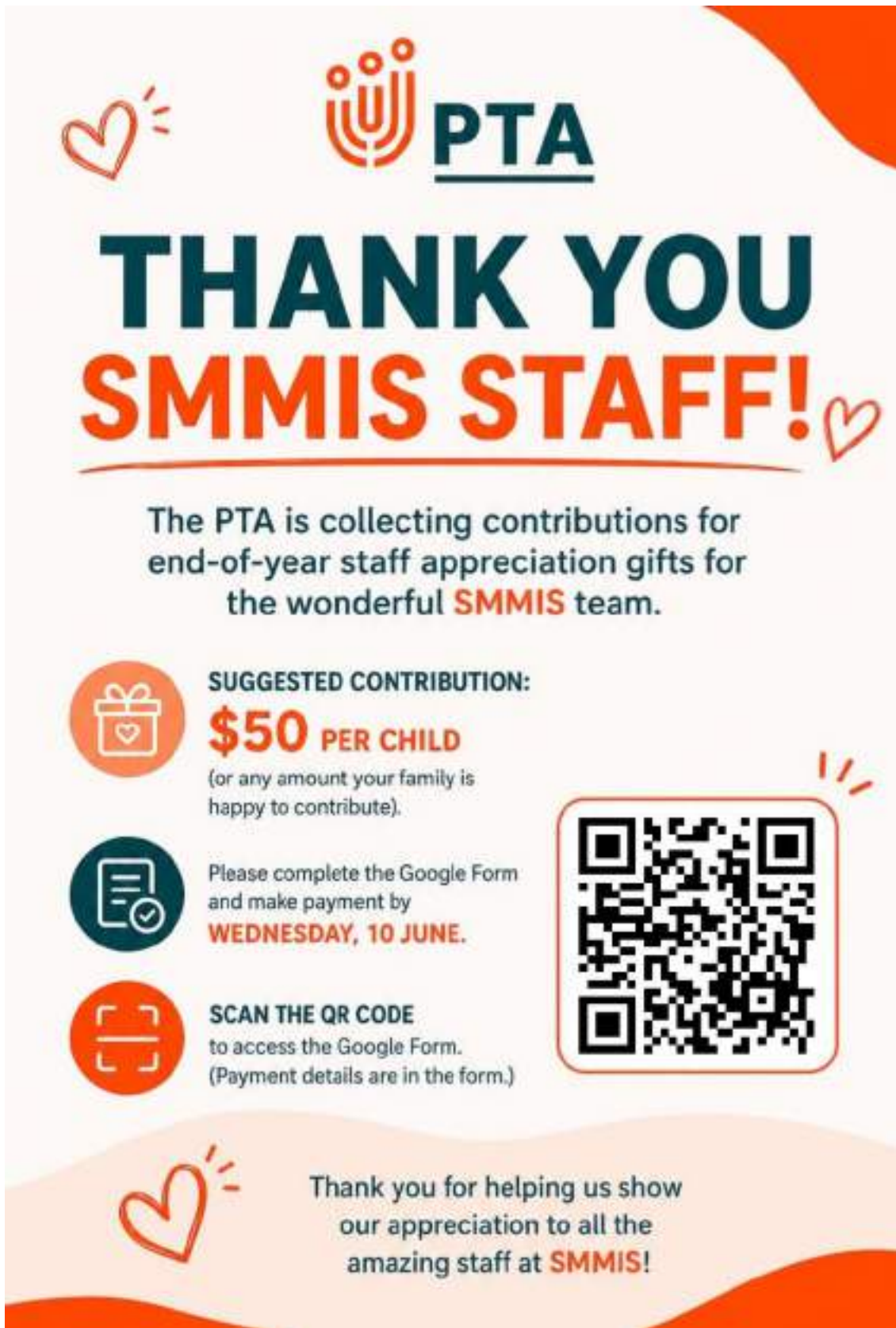
PTA - Thank You SMMIS Staff