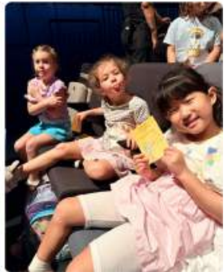
K1-K2 Field Trip: Ballet Performance 28th May 2026