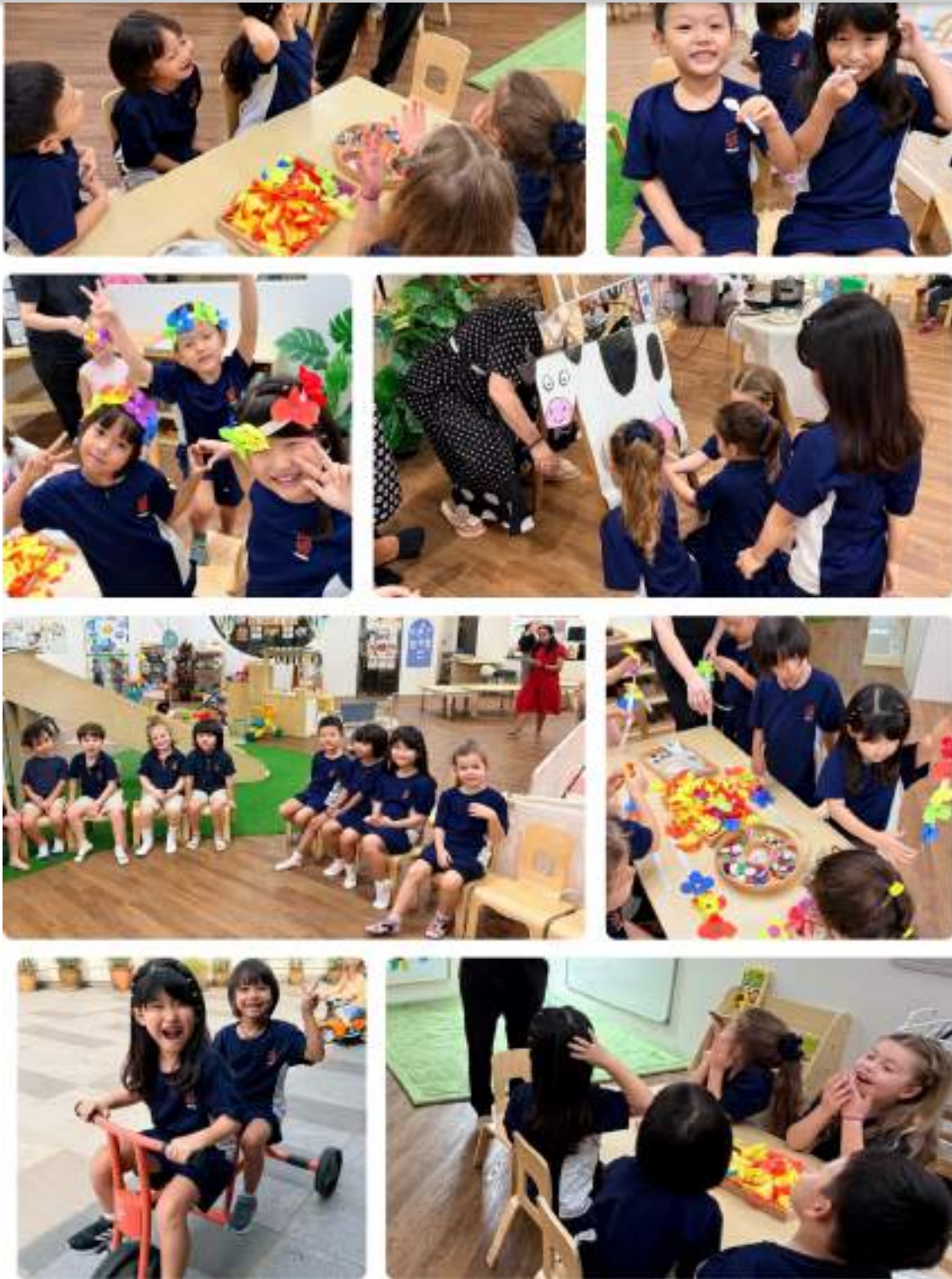
Nursery & K1 visit to Ganenu 18th May 2026