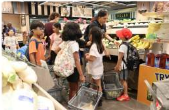
K2-G1 trip to Sembawang Shopping Center 18th May 2026