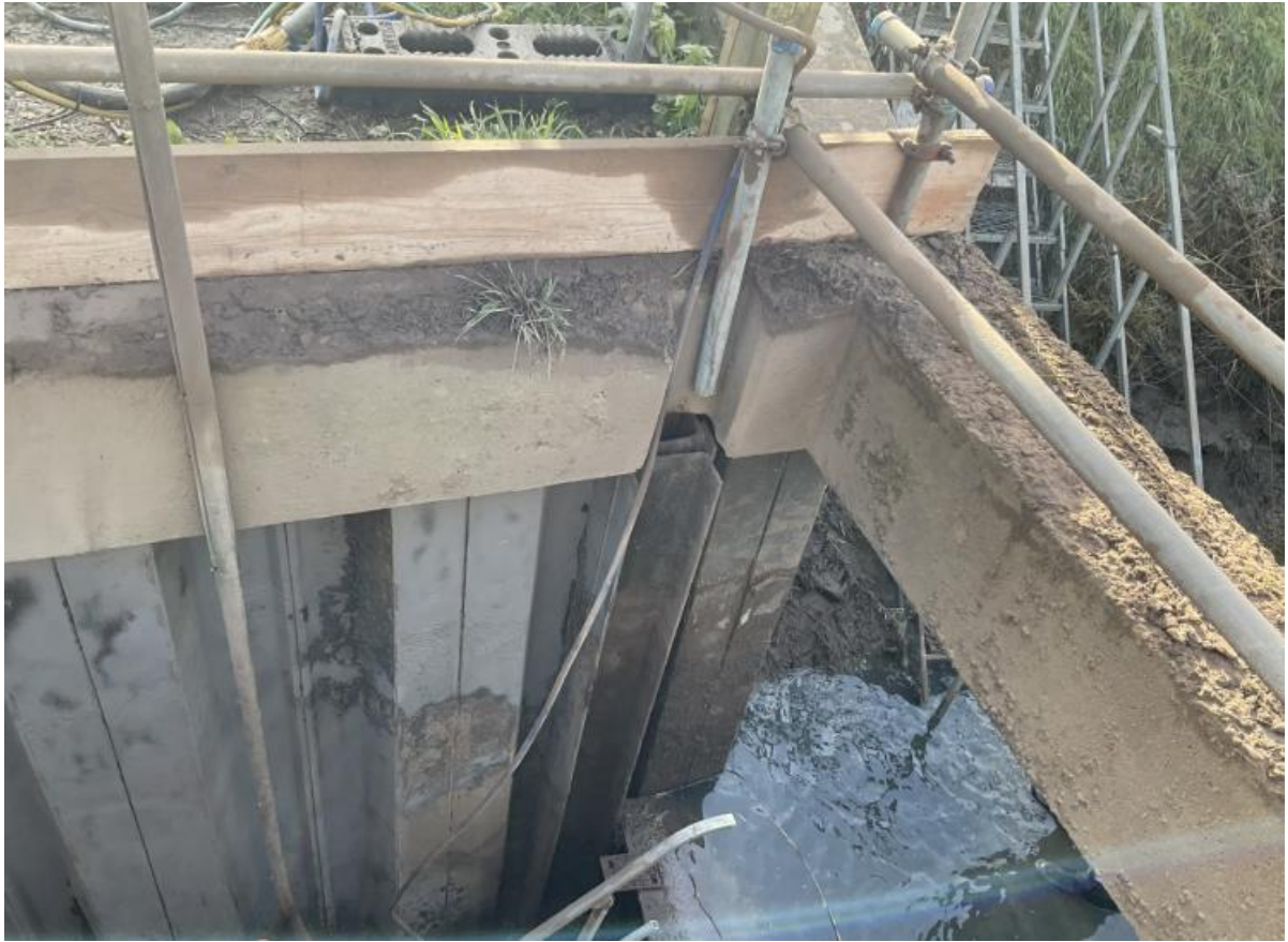
Marshfield Grit blasting of sheet piles