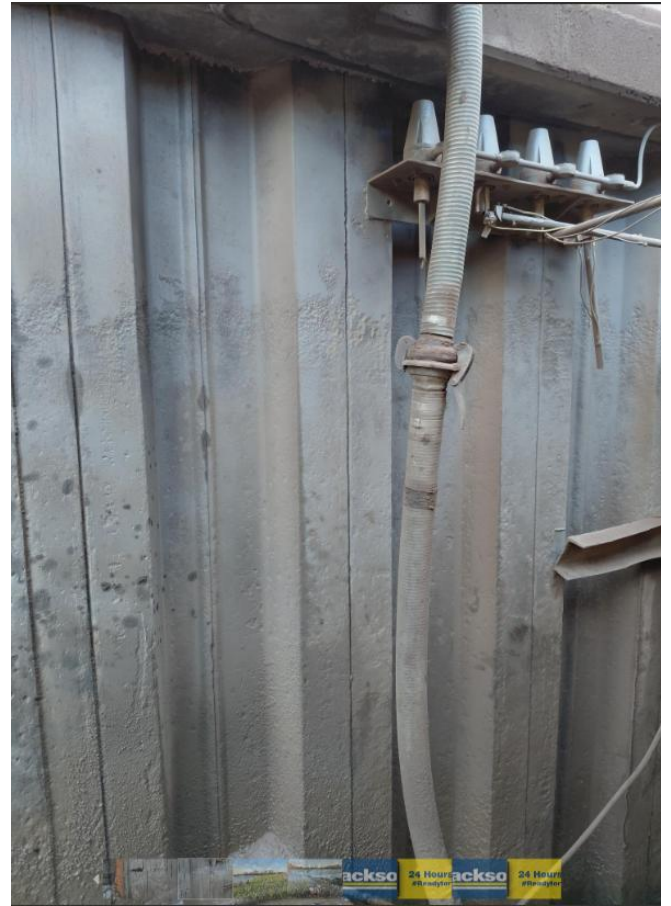
Lapperditch Piles Prepped for Over Plating