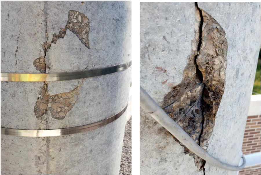
Table 6-5: Spun Concrete Pole, Pole and Foundation Element Distresses

Unit of Measure: Length, feet along member which apply to each condition state