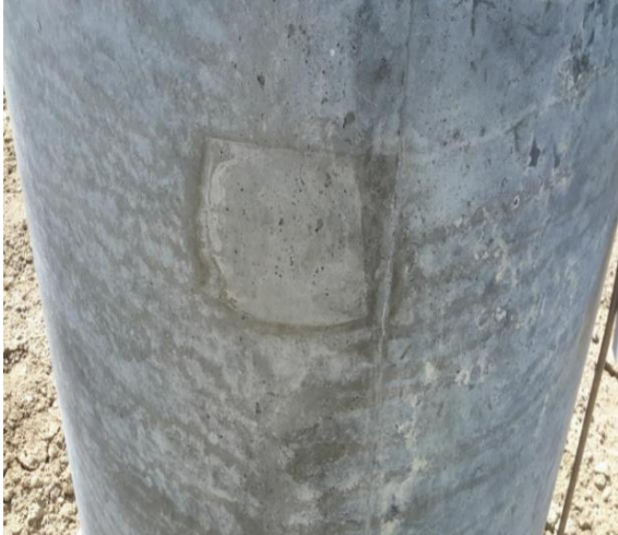
Figure 6-5: Crack with rusted rebar water leakage