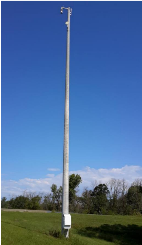
Figure 6-3: Spun Concrete Pole

The uprights support the camera and camera arm, or other attachments. The routine inspection assesses the vertical structure's ability to safely support the attachments and transfer all loads to the foundation. The routine inspection is performed on a regularly scheduled basis, with frequency determined by the structure inspection needs, and includes the vertical structure component rating as determined by the pole and foundation, vertical structure connections, and camera and camera arm element condition ratings. It consists of observations and measurements needed to determine the physical and functional condition of the vertical structure and connections, to identify any changes from initial or previously recorded conditions, and to ensure that the vertical structure and connections continue to satisfy present service requirements. All elements of the component shall be visually inspected at a distance that is close enough to determine the overall condition and to detect deficiencies. Binoculars are used as a visual aid if closer access with equipment or climbing is not available.