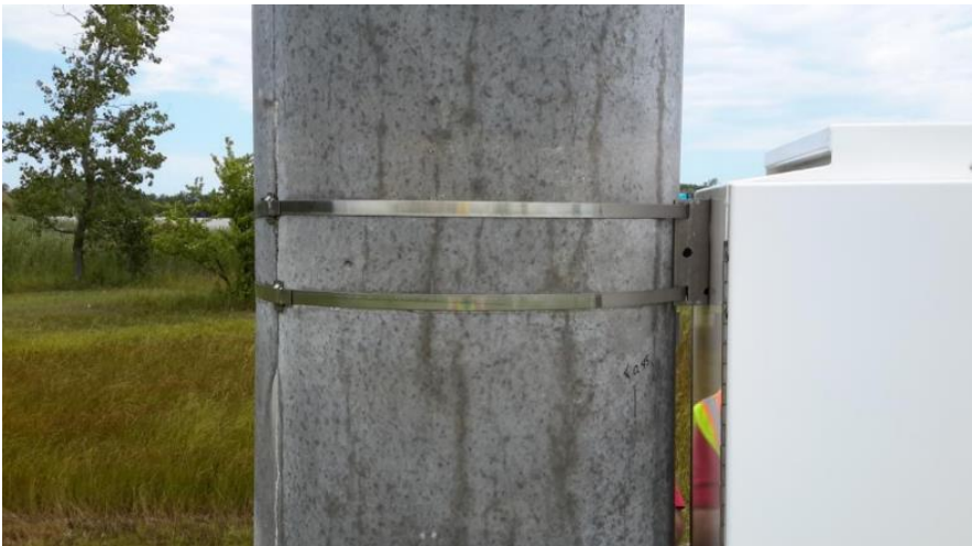
Figure 6-7: Band clamp connection to metal enclosure

present, and note any that are not. Check for misalignment of the bolts. Identify and measure any gaps between the nut or the head of the bolt and the washer. Note any gaps between the bolted flanges, loose, or missing hardware, missing caps, and cracks at the ends of gusset plates. Using a 16- to 24-oz hammer, hit the nuts on the flat portion, in multiple directions if possible, listening for a dull sound or a sharp ringing sound. A dull sound may indicate that the nuts are not properly tightened or that the bolt is cracked or broken. While sounding, look for any shift of the bolt within the bolt hole or movement of the nut. Note any signs of corrosion.