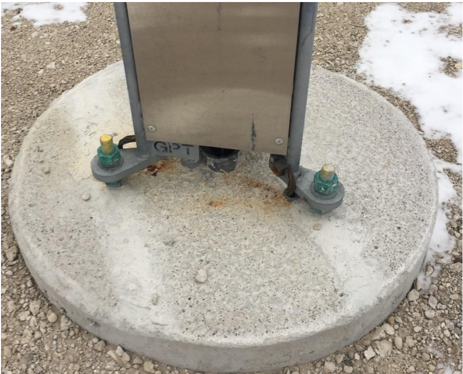
Figure 14-4: ESS tower foundation with triangular anchor bolt pattern

The anchor bolts transfer load from the structure into the foundation. For ESS Towers, this element addresses the bolts in connection with the concrete foundation only.