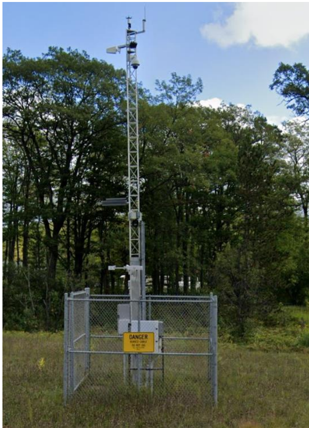
Figure 14-3: ESS Tower

ESS Tower standard inspection frequency is once every 4 years for arm's length inspection and once every 2 years for visual inspections, unless otherwise identified for more frequent inspection. A visual inspection may consist of use of binoculars to inspect the structure portions that cannot be reasonably observed within "arm's length" (approximately 2 feet) distance.