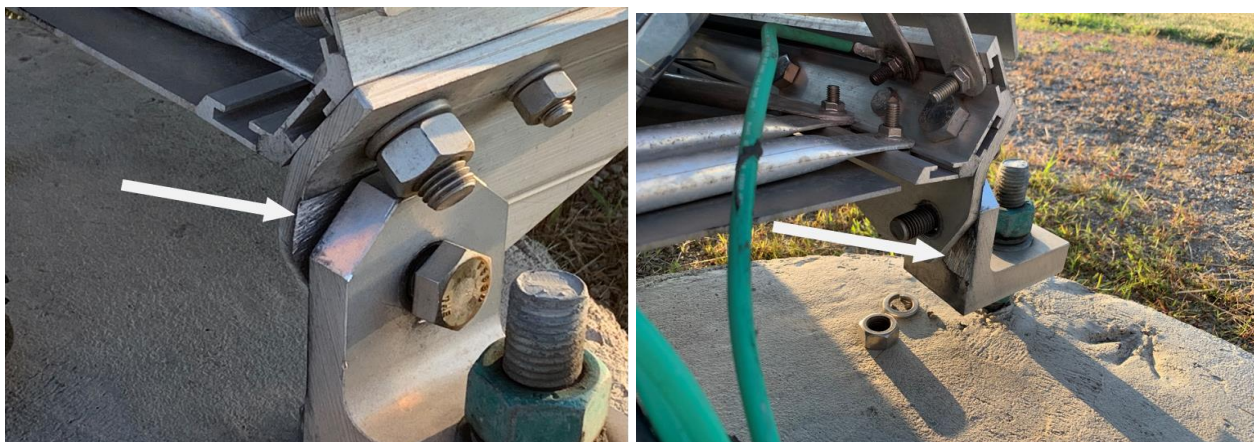
Figure 14-9: Evidence of wear on metal due to oscillation along with loose connection

Examples of applicable priority level items include, but are not limited to: