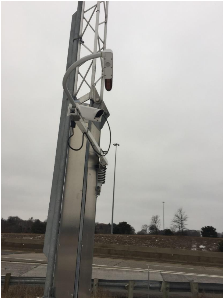
Figure 14-7: ESS tower vertical support column with ITS attachments