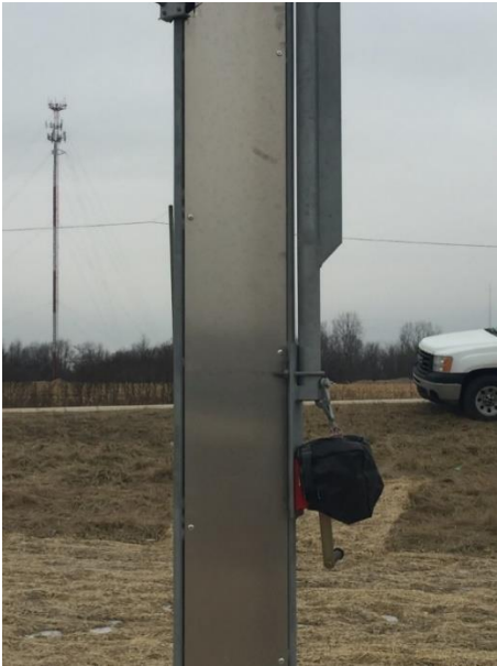
Figure 14-8: ESS tower lowering boom element