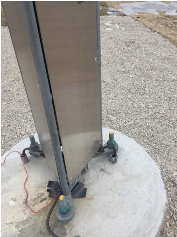
Figure 14-6: ESS tower base plate