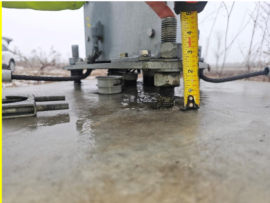
Figure 14-5: Standoff measurement for a sound foundation

The standoff distance is an indication of whether or not the anchor rods are subjected to bending moment stress. For double-nut connections, if the clearance between the bottom of the leveling nuts and the top of the concrete foundation is less than or equal to one bolt diameter, bending stresses in the anchor bolts can be disregarded (AASHTO LRFD Specifications for Structural Supports, sec. 5.16.3.1). Any distance greater than one bolt diameter may be cause for concern.