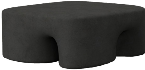
ELEPHANT | CENTER TABLE