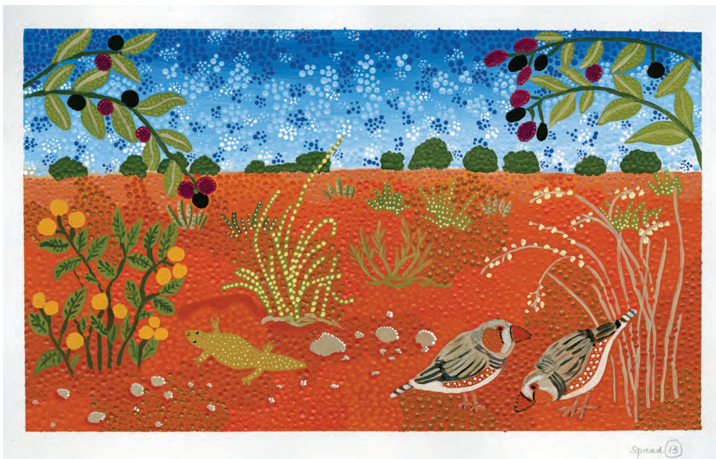
VALERIE BRUMBY Rain On The Rock 13 , 2024 51 × 73 cm Acrylic on Paper $2700