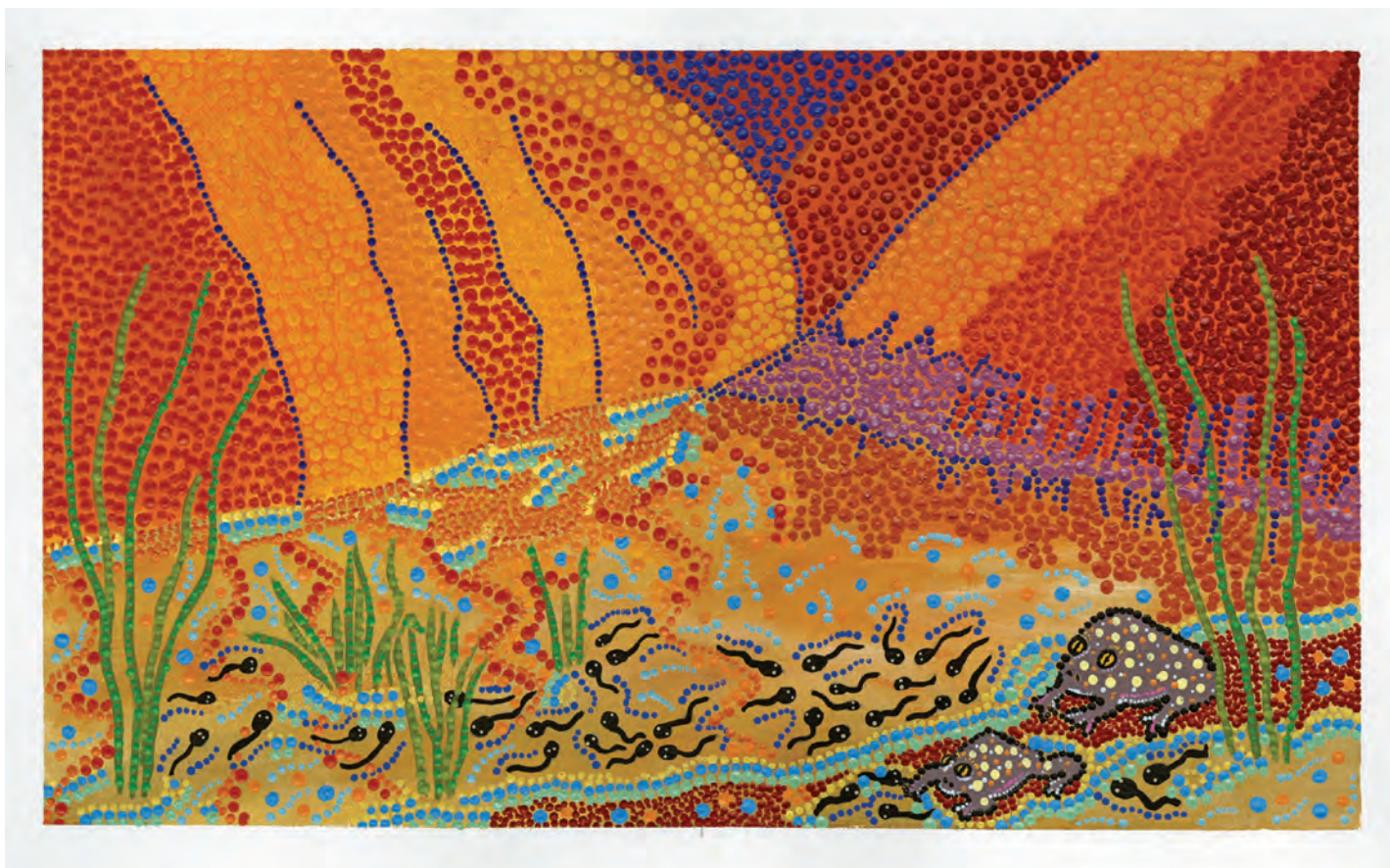
VALERIE BRUMBY Rain On The Rock 8 , 2024 51 × 73 cm Acrylic on Paper $2700