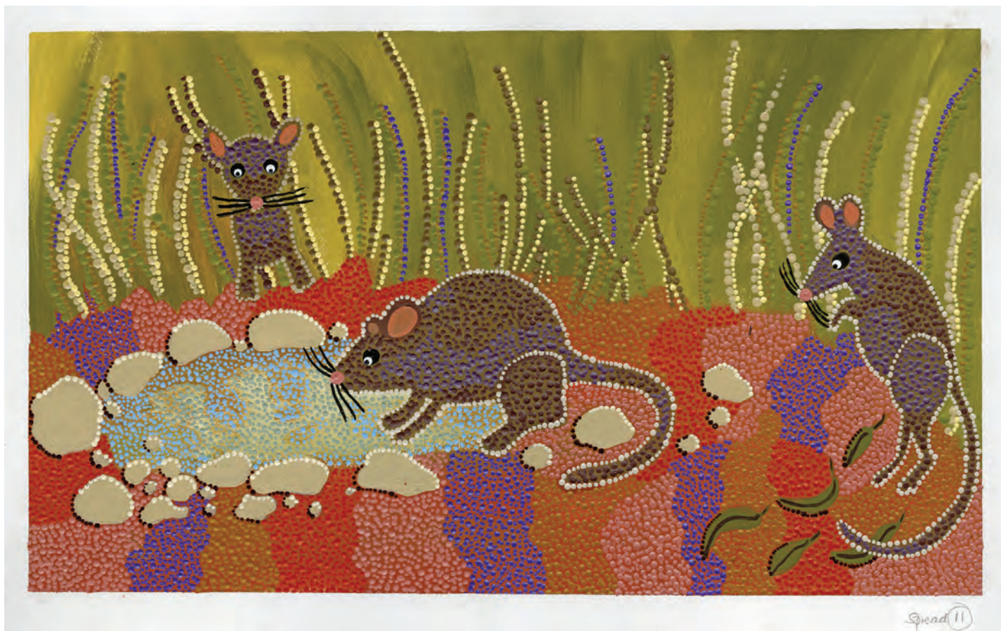
VALERIE BRUMBY Rain On The Rock 11 , 2024 51 × 73 cm Acrylic on Paper $2700