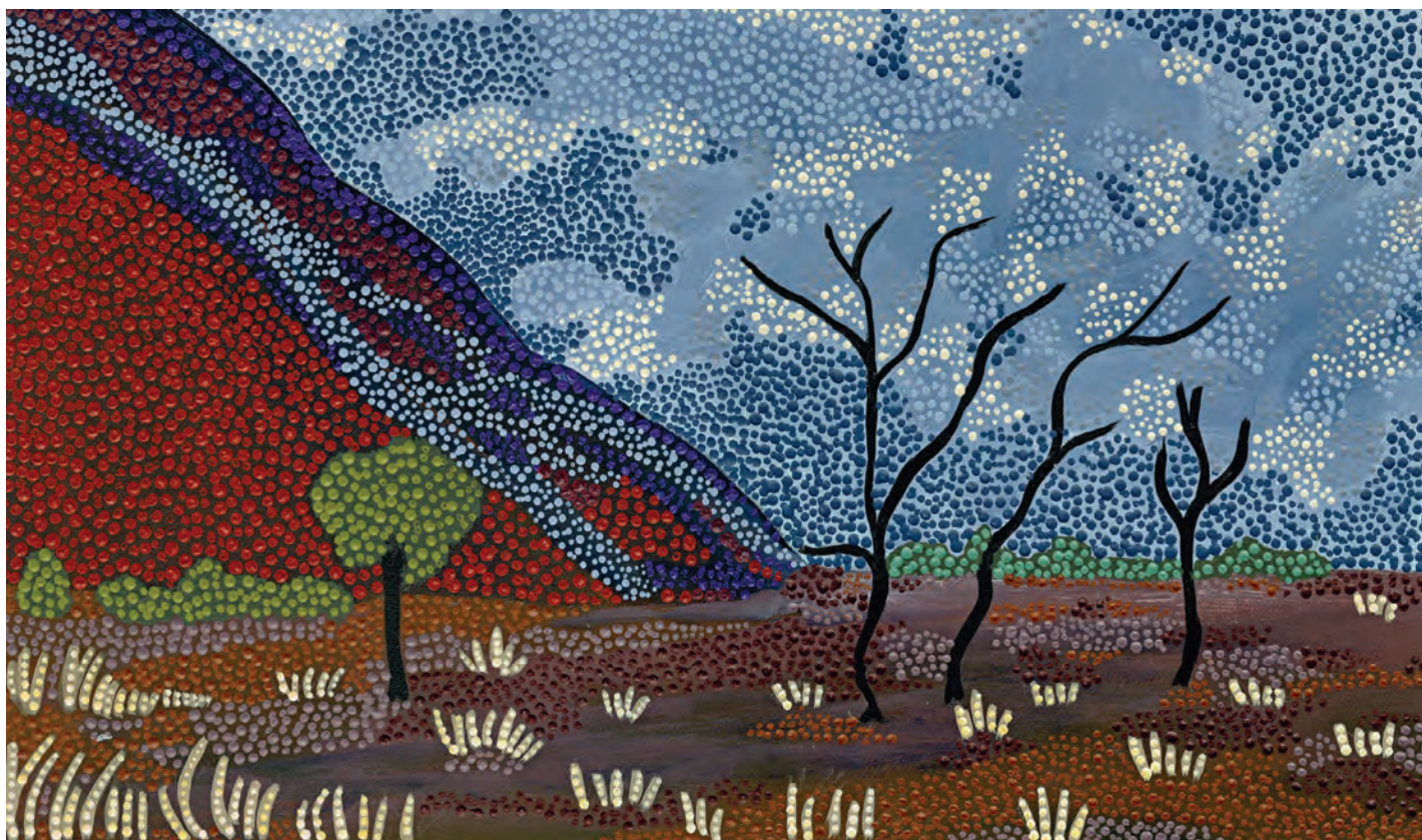
VALERIE BRUMBY Rain On The Rock 10 , 2024 51 × 73 cm Acrylic on Paper $2700