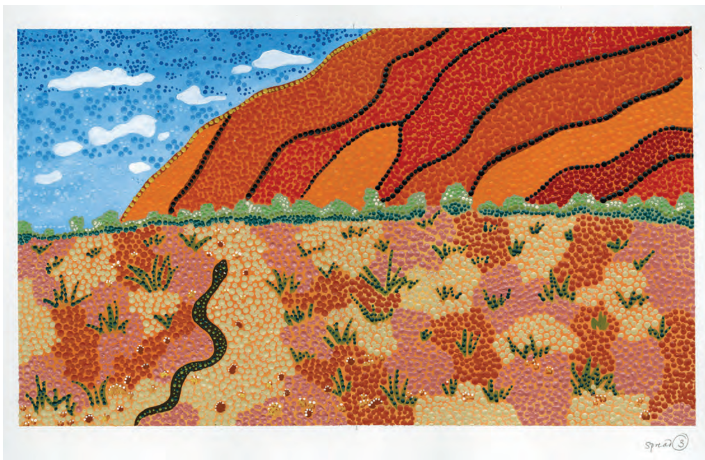
VALERIE BRUMBY Rain On The Rock 2 , 2024 51 × 73 cm Acrylic on Paper $2700