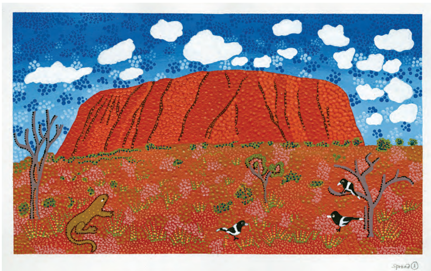
VALERIE BRUMBY Rain On The Rock 1 , 2024 51 × 73 cm Acrylic on Paper SOLD