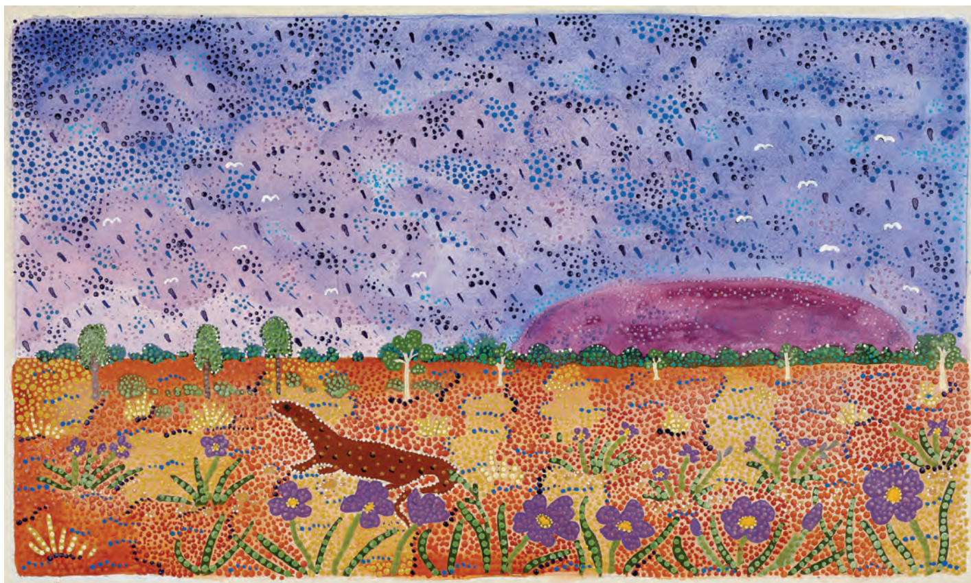
VALERIE BRUMBY Rain On The Rock 15 , 2024 51 x 73 cm Acrylic on Paper SOLD