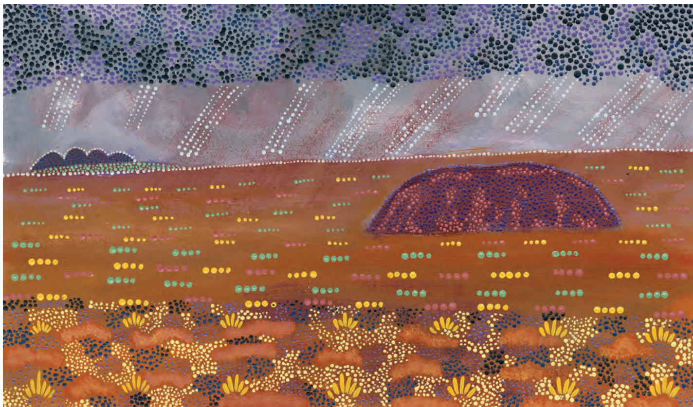
VALERIE BRUMBY Rain On The Rock 5, 2024 51 × 73 cm Acrylic on Paper $2700