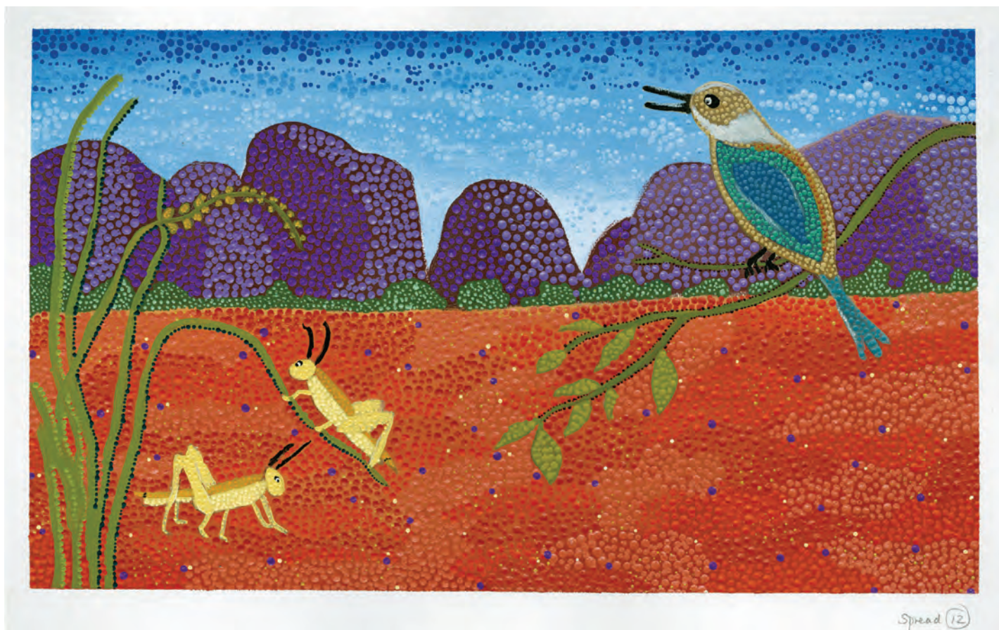
VALERIE BRUMBY Rain On The Rock 12 , 2024 51 x 73 cm Acrylic on Paper SOLD