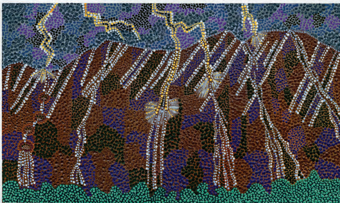
VALERIE BRUMBY Rain On The Rock 6 , 2024 51 × 73 cm Acrylic on Paper $2700