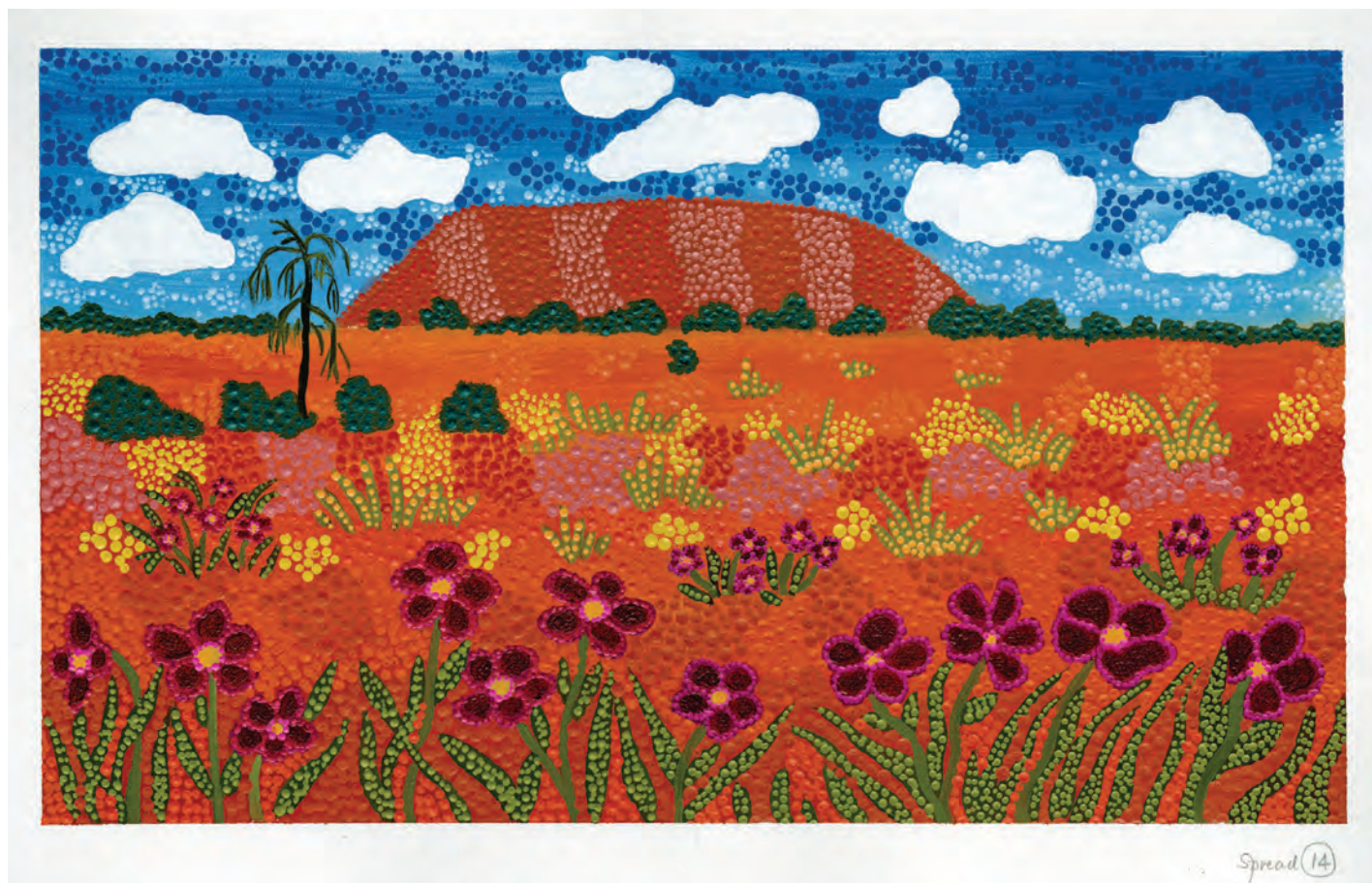
VALERIE BRUMBY Rain On The Rock 14 , 2024 51 × 73 cm Acrylic on Paper SOLD