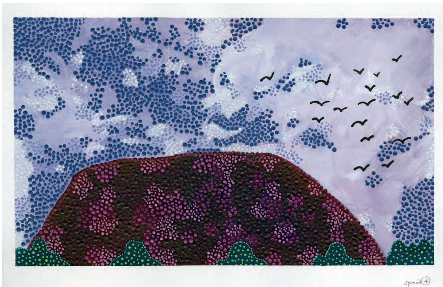
VALERIE BRUMBY Rain On The Rock 4 , 2024 51 × 73 cm Acrylic on Paper $2700