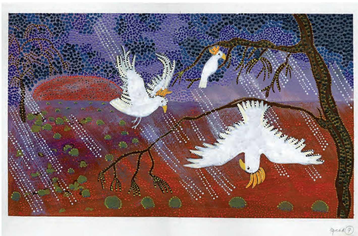
VALERIE BRUMBY Rain On The Rock 7, 2024 51 x 73 cm Acrylic on Paper $2700