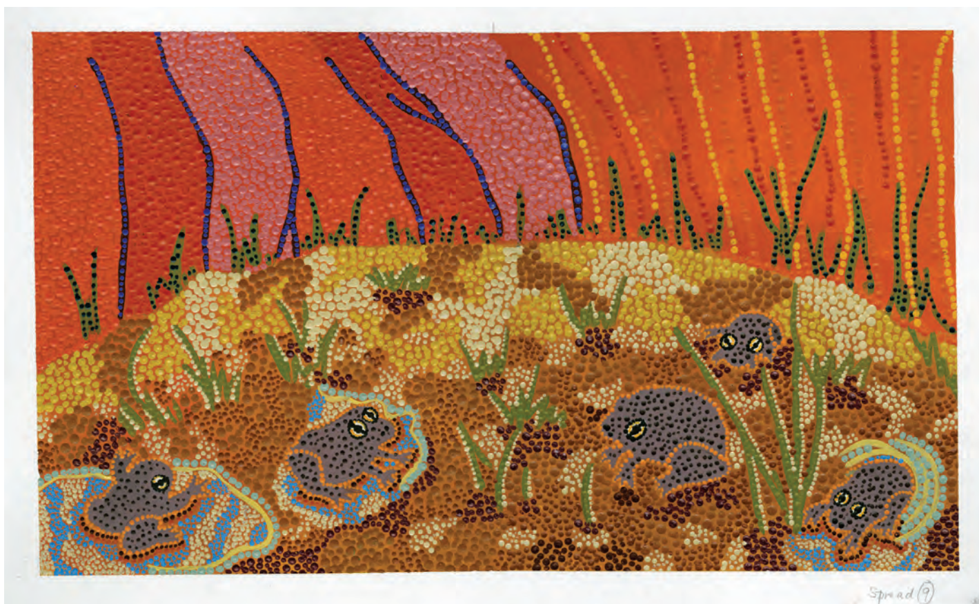
VALERIE BRUMBY Rain On The Rock 9 , 2024 51 × 73 cm Acrylic on Paper $2700