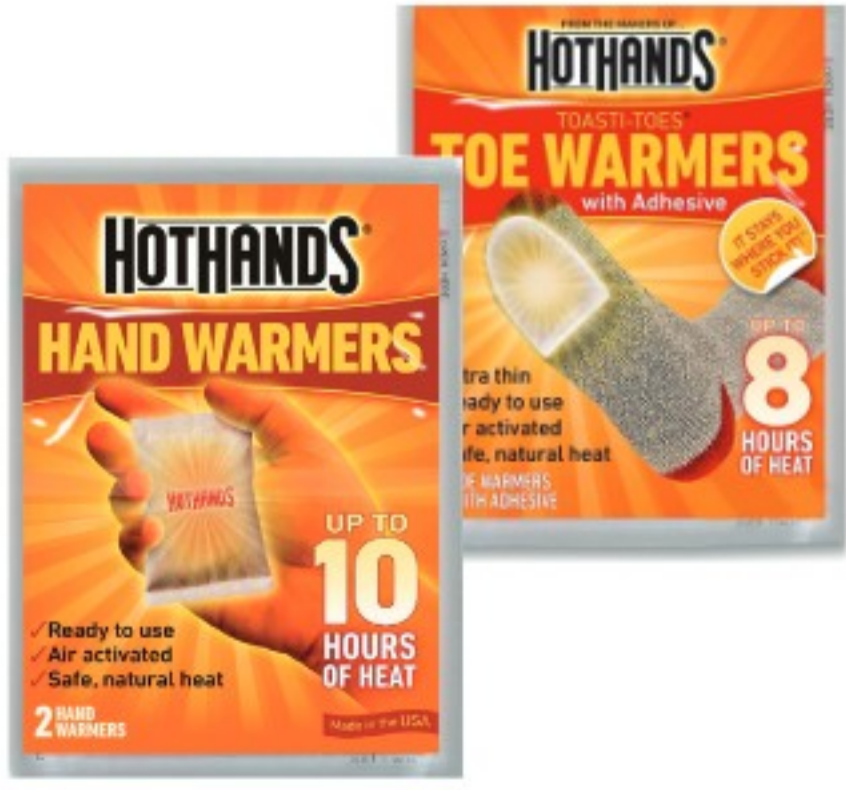
⊛ HotHands Hand or Toe Warmers 2 Pack