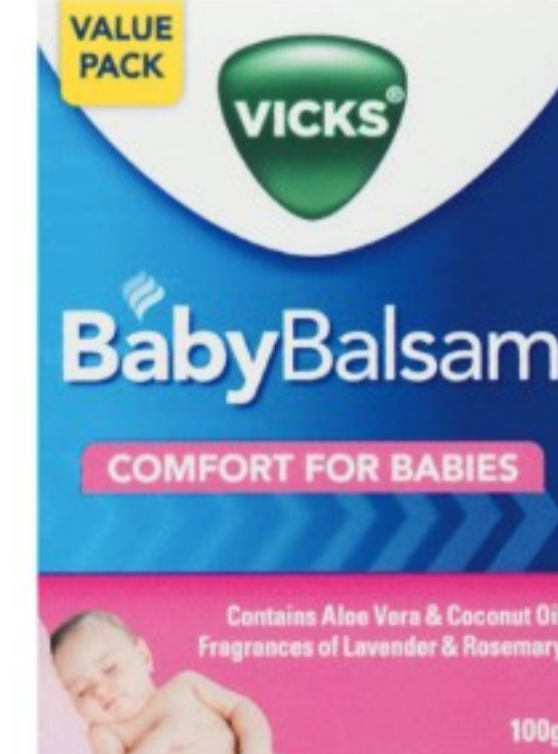
Vicks Baby Balm 100g $12.99 ea