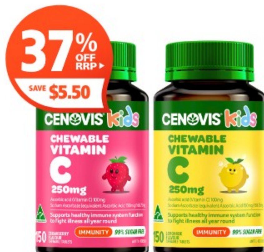
Cenovis Chewable Vitamin C 250mg 150 Tablets Selected Varieties $9.49 ea