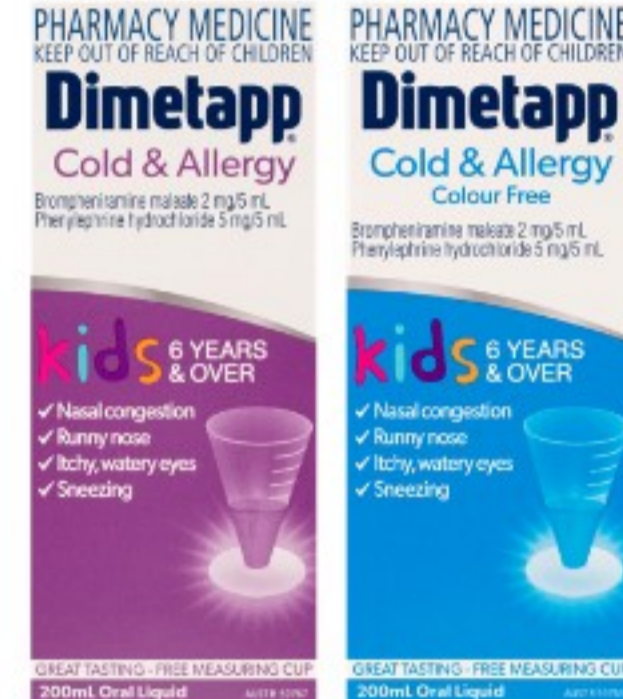
Dimetapp Kids Cold & Allergy or Cold & Allergy Colour Free 6 Years & Over 200mL $15.99 ea