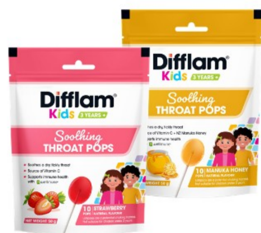
Diffiam Kids Throat Pops 10 Pack Selected Varieties $7.49 ea