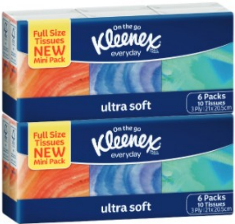
Kleenex Ultra Soft Pocket Mini 6 Pack