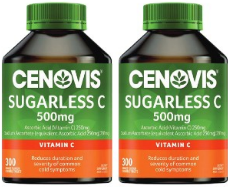
⊕ Cenovis Sugarless C 500mg 300 Chewable Tablets