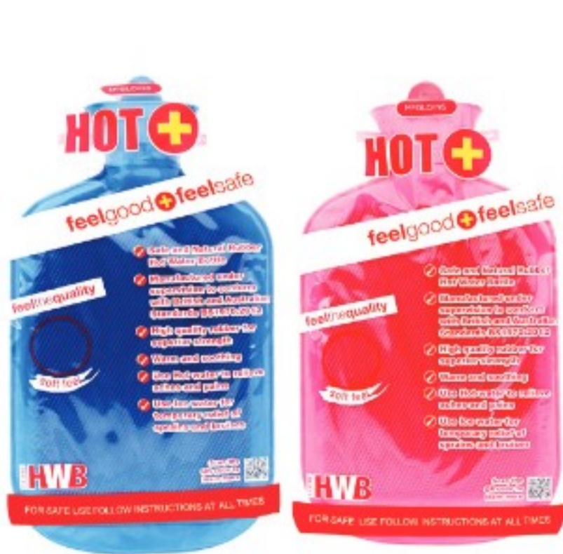
⊛ Hot Water Bottle Selected Varieties