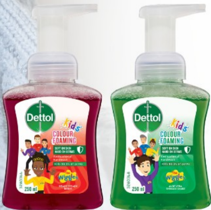
Dettol Kids The Wiggles Foaming Hand Wash 250ml Selected Varieties