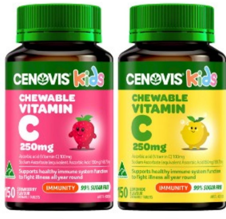
⊕ Cenovis Chewable Vitamin C 250mg 150 Tablets Selected Varieties