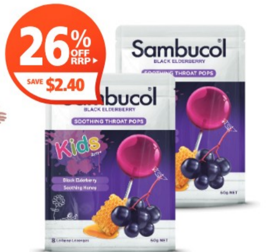
Sambucol Kids Soothing Throat Pops 8 Pack $6.99 ea