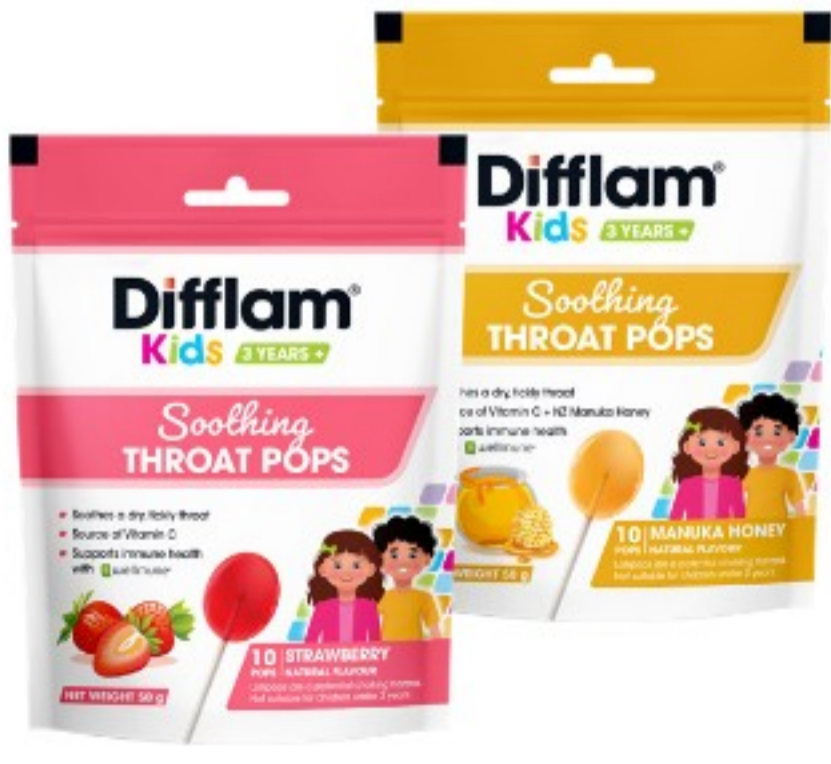
Difflam Kids Throat Pops 10 Pack Selected Varieties