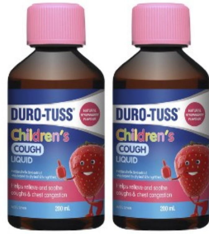
Duro-Tuss Children's Cough Liquid Strawberry 200ml $14.99 ea