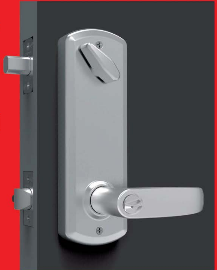
5.5" Entry lock with turn button left hand shown