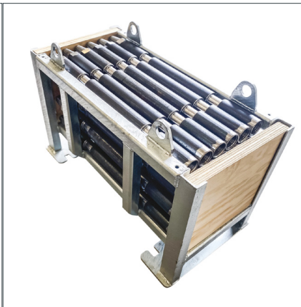
Steel rod container