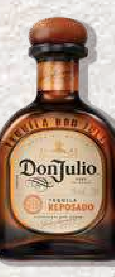
Don Julio Reposado - Mexico