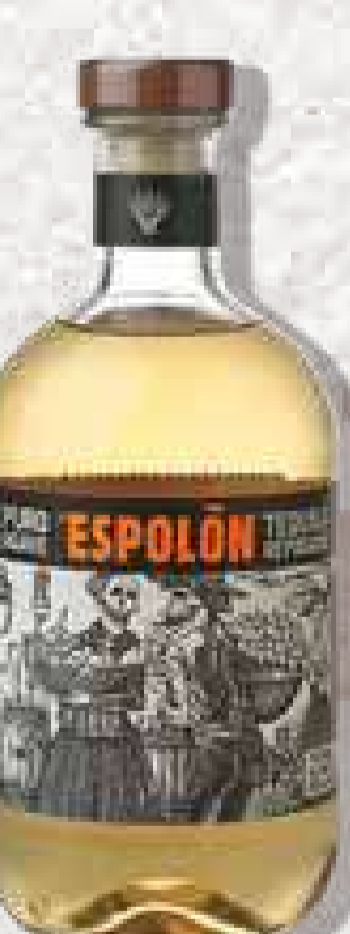
Espolon Reposado - Mexico