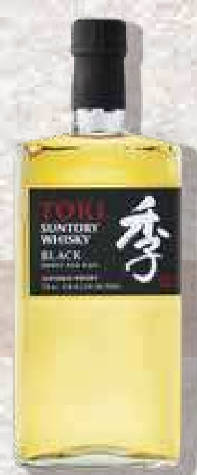
Toki Black, Smoky & Rich - Japan