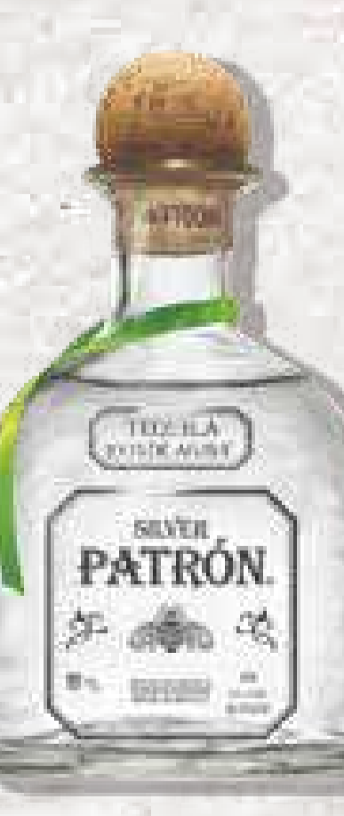
Patron Silver - Mexico