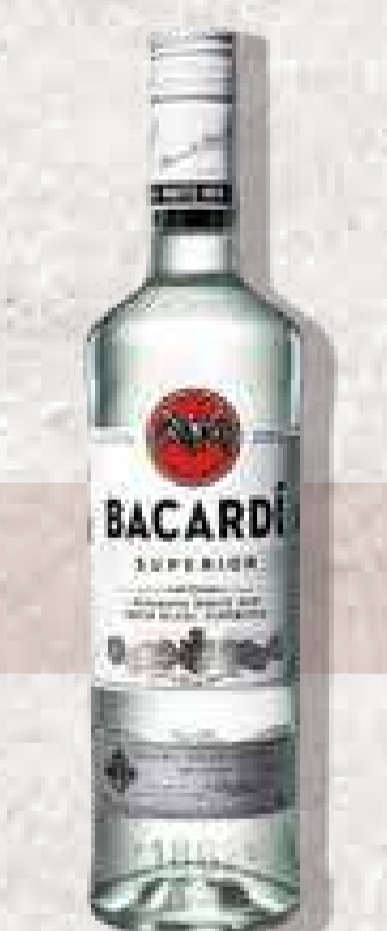
Bacardi White - Puerto Rico