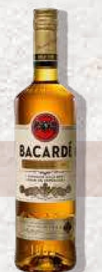
Bacardi Gold - Puerto Rico