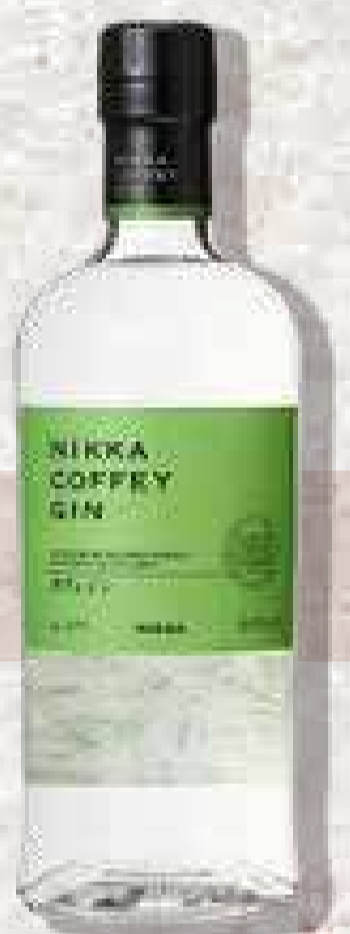
Nikka Coffey Gin - Japan