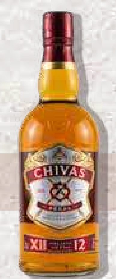
Chivas Regal 12 Y/O - Scotland