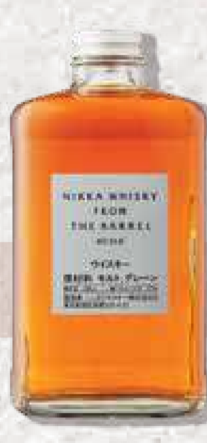
Nikka - From The Barrel - Japan