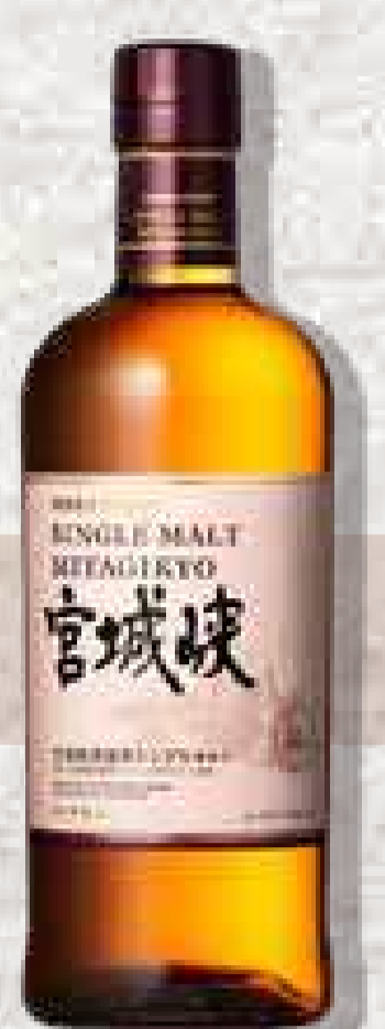
Nikka - Miyagikyo Single Malt - Japan