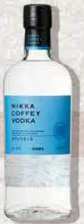
Nikka Coffey Vodka - Japan