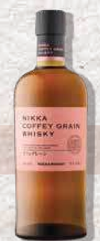
Nikka - Coffey Grain - Japan