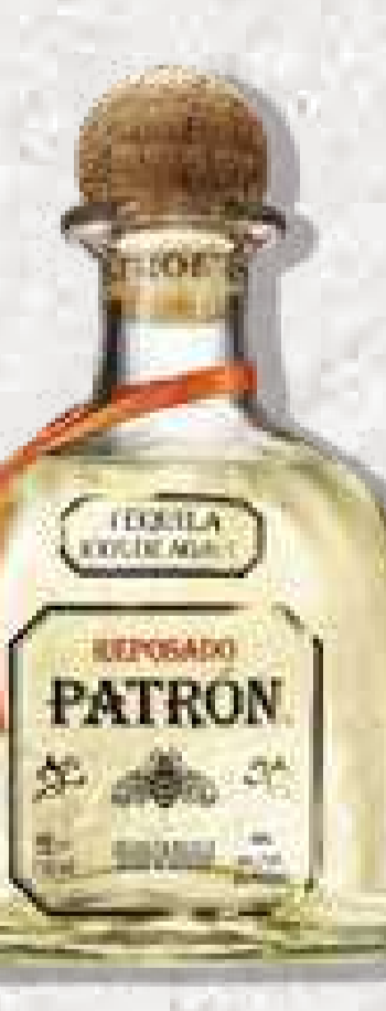
Patron Reposado - Mexico