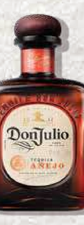
Don Julio Anejo - Mexico