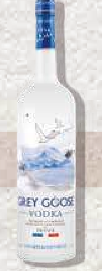
Grey Goose - France