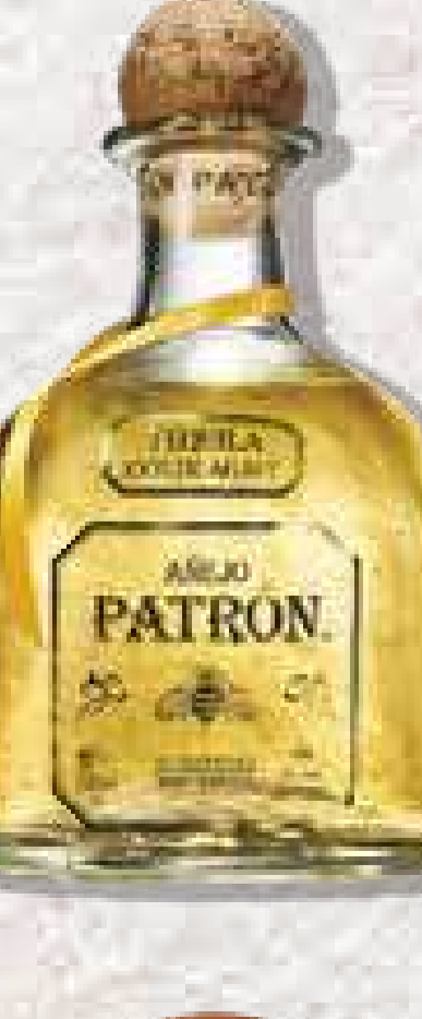
Patron Anejo - Mexico