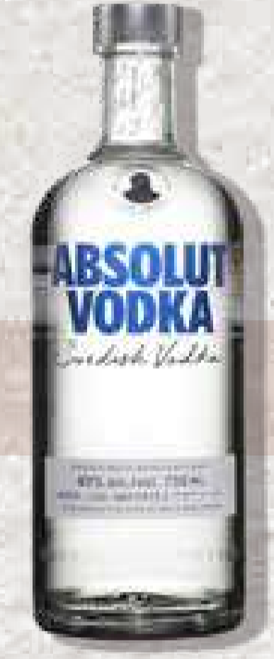
Absolut Vodka - Sweden