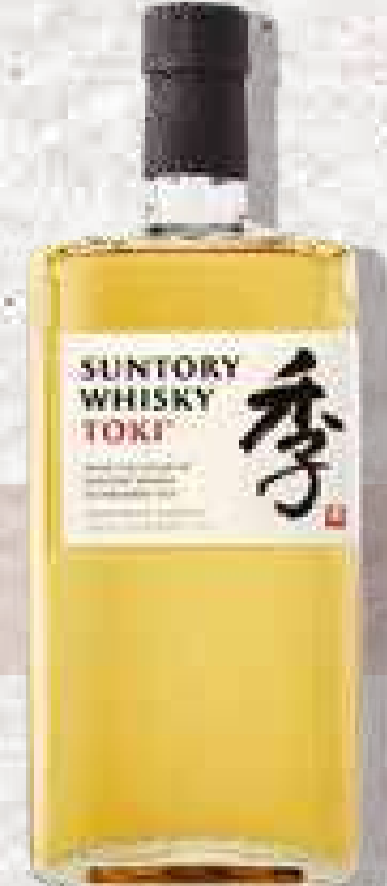
Toki - Japan