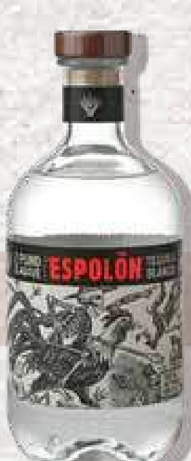
Espolon Blanco - Mexico