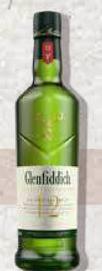
Glenfiddich 12 Y/O - Single Malt - Scotland