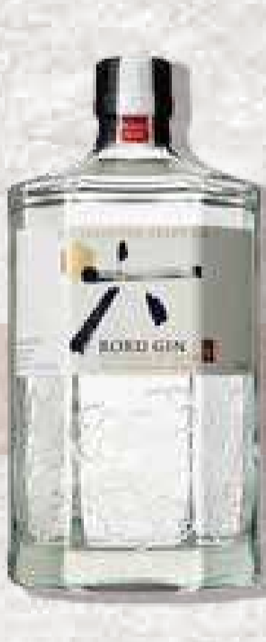
Roku Gin - Japan