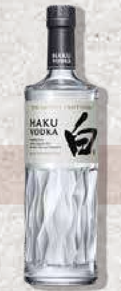
Haku Vodka - Japan