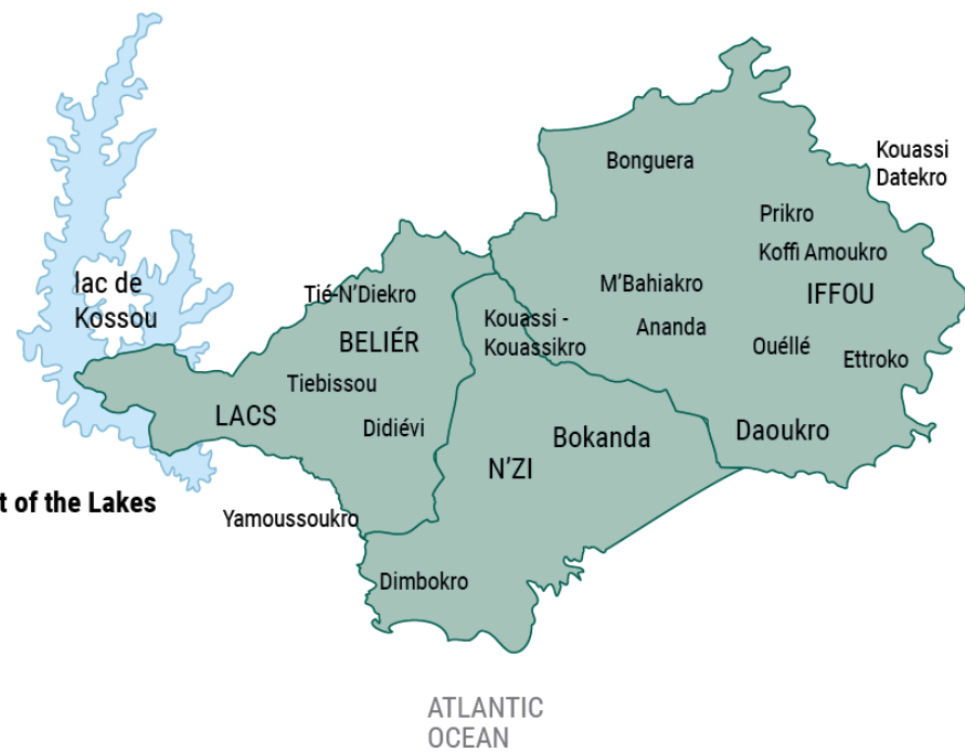
DISTRICT OF THE LAKES