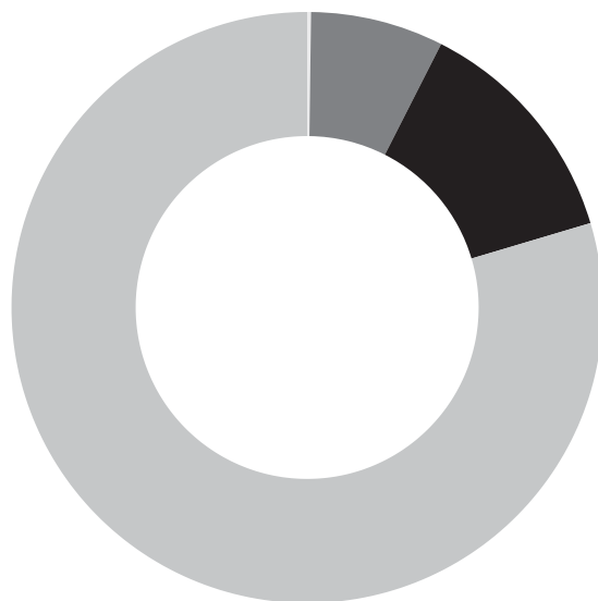
MATURITY WEIGHTINGS (as of % Net Assets)

1-3 Years 0.07% 5-10 Years 2.43% No Maturity 4.31% > 10 Years 26.59%