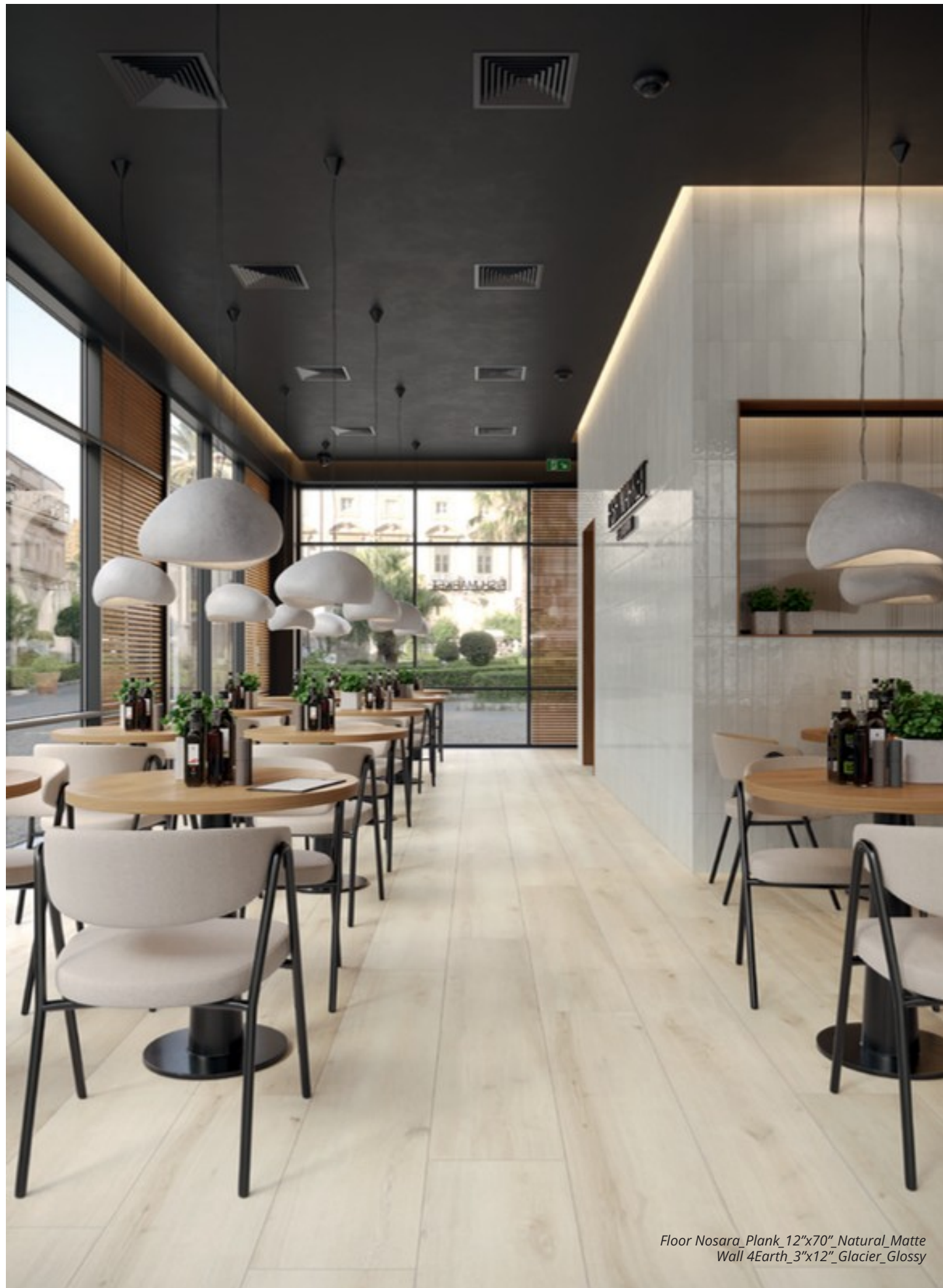
Floor Nosara_Plank_12"x70" Natural_Matte Wall 4Earth_3"x12" Glacier_Glossy