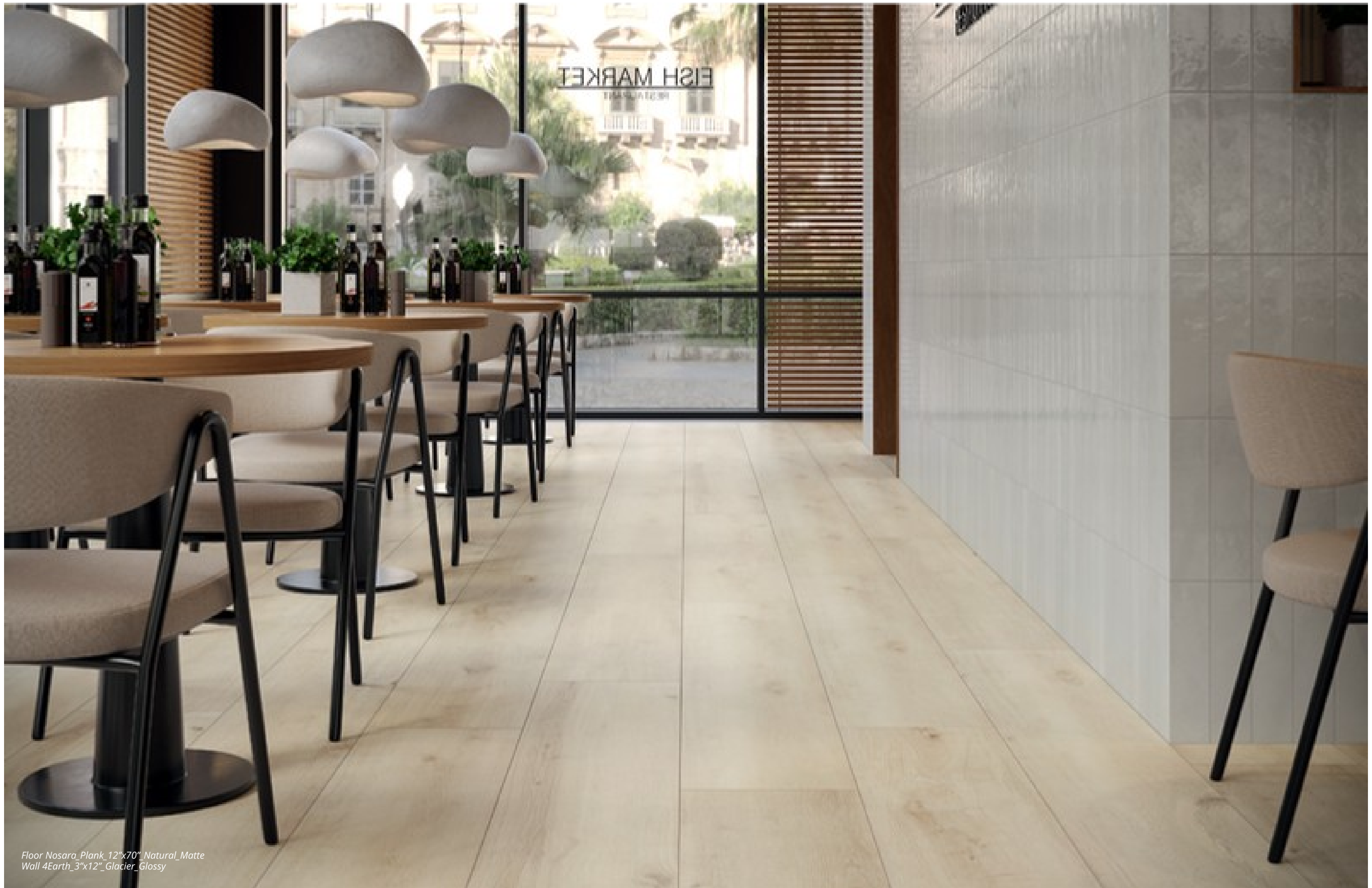
Floor Nosara_Plank_12"x70" Natural_Matte Wall 4Earth_3"x12" Glacier_Glossy