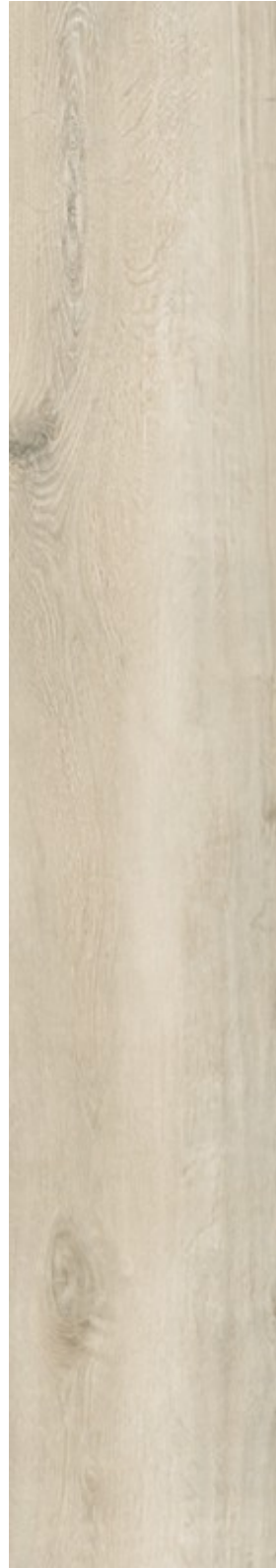
Nosara PLANK NATURAL