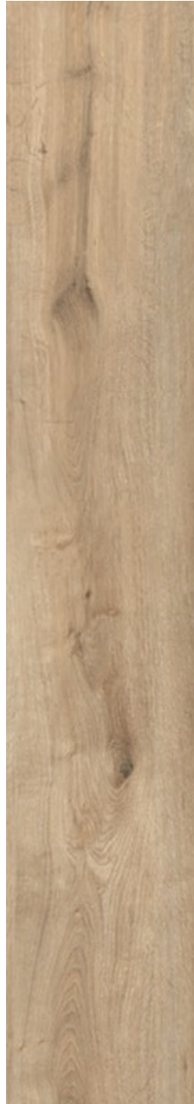
Nosara PLANK HONEY