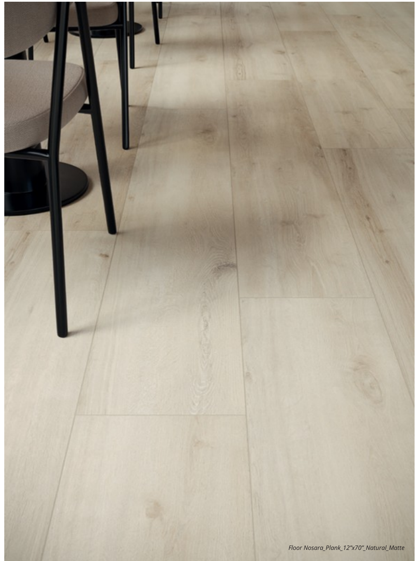
Floor Nosara_Plank_12"x70" Natural_Matte