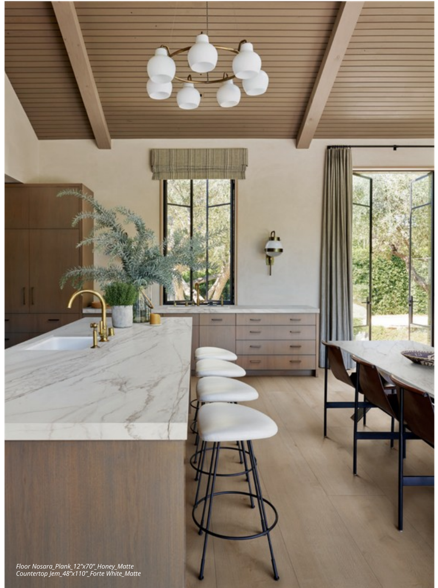
Floor Nosara_Plank_12"x70"_Honey_Matte Countertop Jem_48"x110"_Forte White_Matte