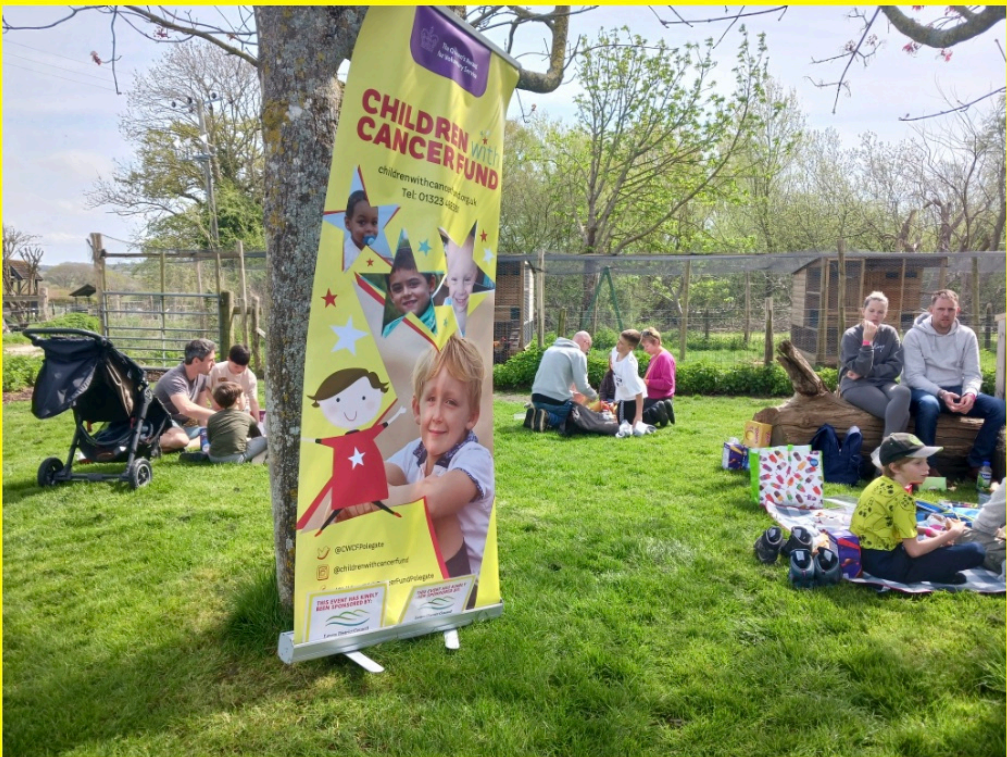
Arlington Bluebell Walk