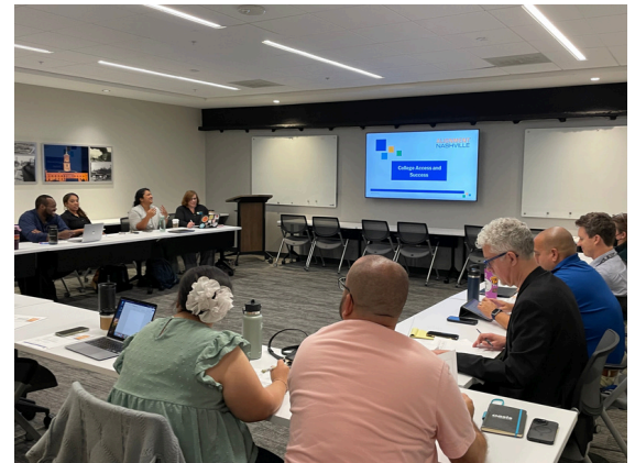
Photo from the first College Access & Success A-Team meeting of the school year