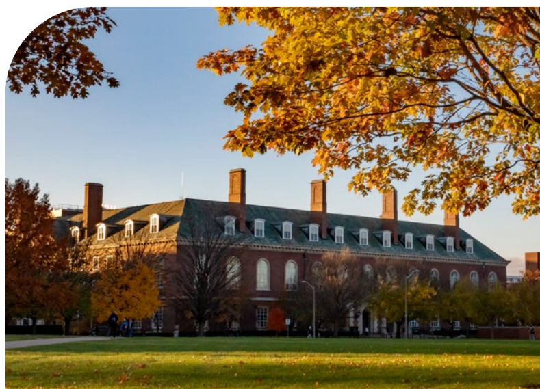
Dean, School of Labor and Employment Relations, University of Illinois Urbana-Champaign