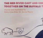
THE RED RIVER CART AND COMING TOGETHER ON THE BUFFALO TRAIL