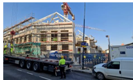
2025 04 17. Roof construction of A and B buildings.