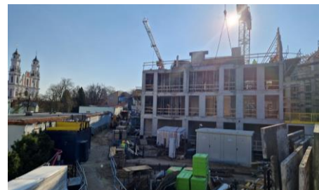
2025 04 17. Construction of C building upper floor.