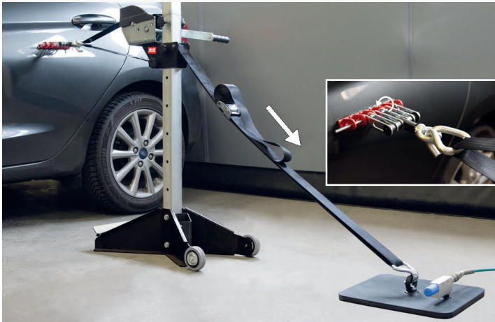
Tower UNI-1096 Pkg. / Door Panel Pull