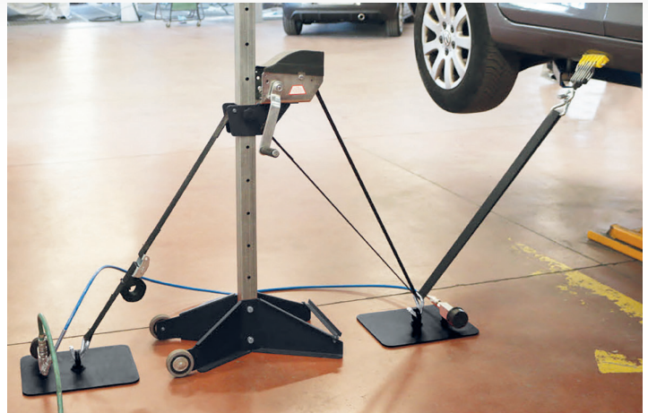
Tower with UNI-1097 / Rocker Panel Pull