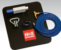
UNI-1097 Second Plate Kit for horizontal holds (keeps vehicle fixed) or downward pulls (rocker panels)