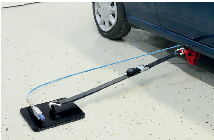
UNI-1097 Plate Kit / Vehicle Holding