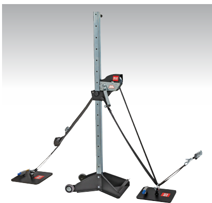
UNI-1096, UNI-1097 & UNI-1098