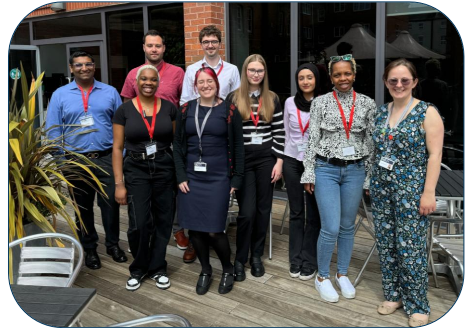
Student auditors, UCEM staff and SOS-UK staff at the 2023/24 UCEM audit.