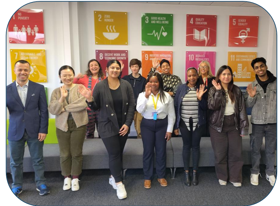
Student auditors and SOS-UK staff at the 2024/25 De Montfort University and Students' Union audit.

Over 80 network learning meetings/events