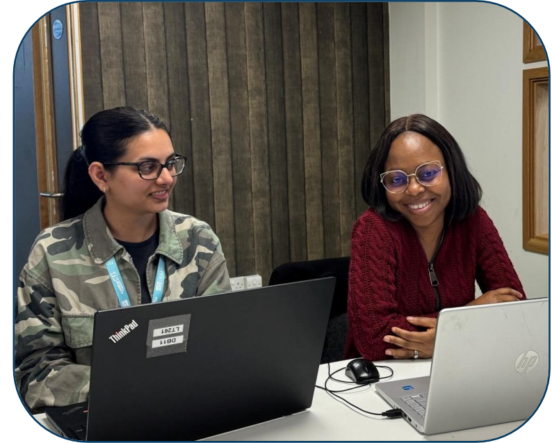
Student auditors at the 2023/24 University of Derby and Students' Union student-led audit

Ready to work with your students to embed sustainability in learning? Sign up on our website.