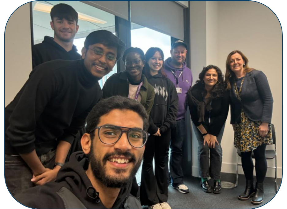
Student auditors, University of Ulster and Ulster Students' Union staff and SOS-UK staff at the 2023/24 University of Ulster and Students' Union audit.