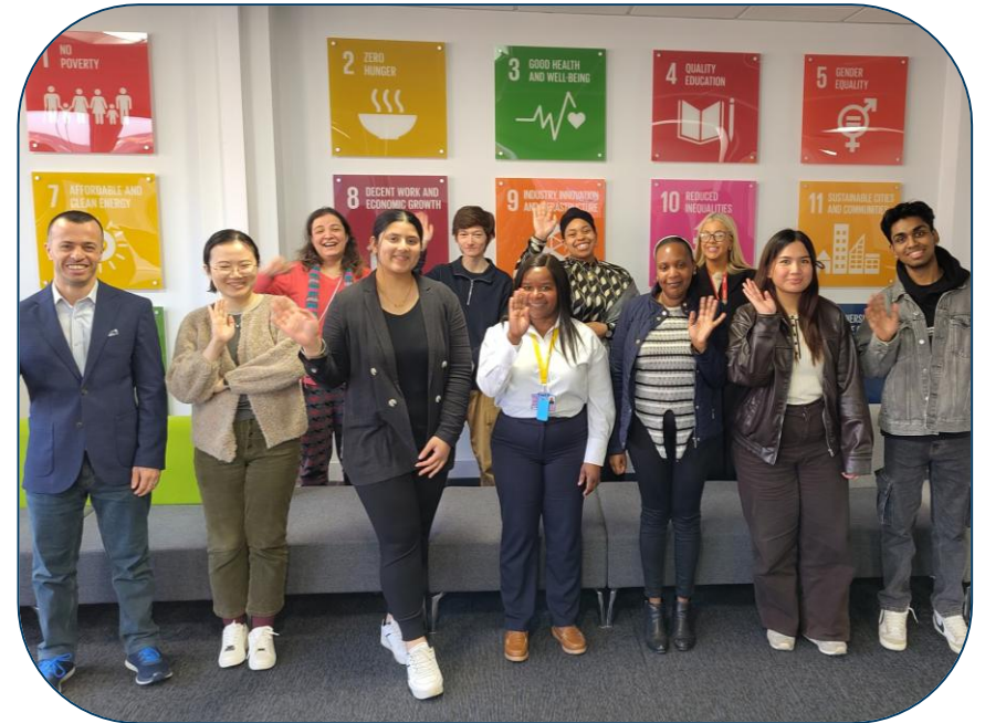
Student auditors and SOS-UK staff at the 2024/25 De Montfort University and Students' Union audit.

Over 80 network learning meetings/events