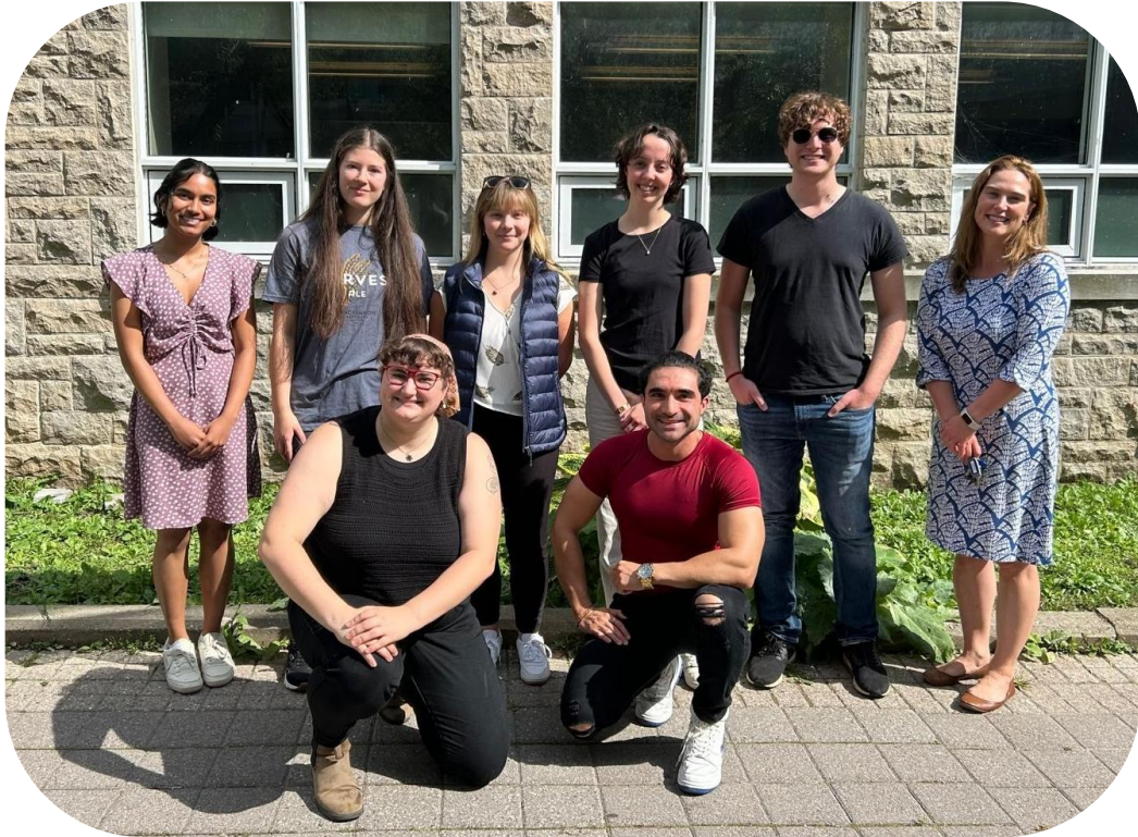
Student auditors and Queen's University staff at the University's first Responsible Futures audit in September 2024

“As a student leader in environmental justice at Queen's University, I know that undergraduates like us play a critical role in addressing the climate crisis.