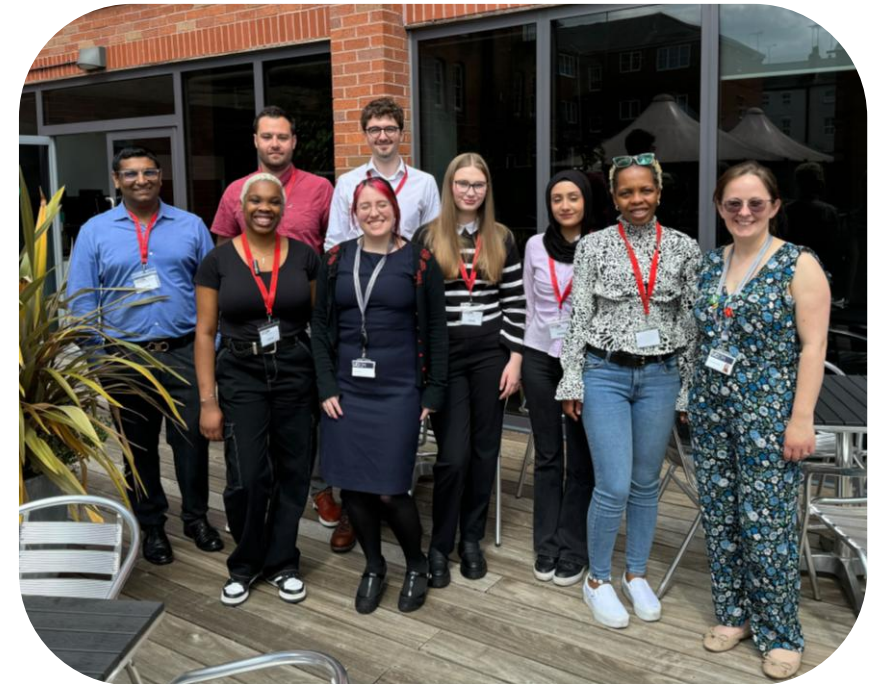
Student auditors and staff at the University of the Built Environment's June 2024 audit