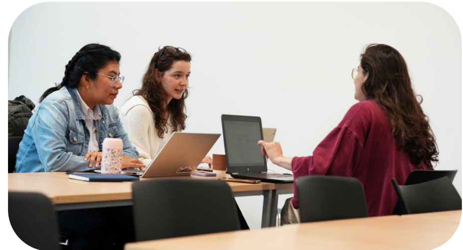
Student auditors at the University of Strathclyde's second audit in June 2025

* Responsible Futures runs on a two-year cycle, with a student-led audit taking place every two years.