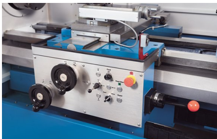
Micro-control via electronic hand-wheels - but handling and positioning just as with a conventional machine