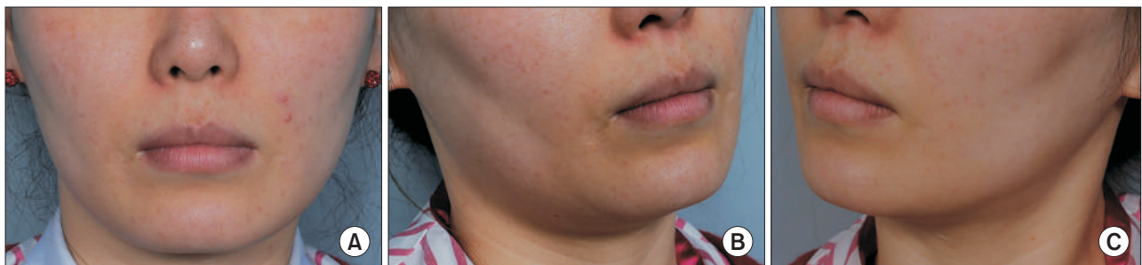
Fig. 3. A 38-year-old woman shows excellent post-treatment improvement (C) compared to the control site (B), initial photo before HIFU treatment is shown in (A).

In the present study, two treatment passes were performed using two different probes. The first pass made a thermal coagulation zone that extended from the superficial adipose layer through the SMAS. The second pass created a wider vertical zone of thermal injury while still sparing the epidermis and papillary dermis, which results in effective skin tightening. Our study revealed that 94% of the research subjects described clinical improvement in skin lifting after the procedure. In a previous clinical study performed by Lee et al., 2 80% of the subjects were found to describe clinical enhancement with HIFU treatment. Also, HIFU treatment on periorbital