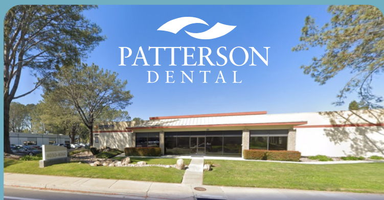
PATTERSON DENTAL EDUCATION CENTER

4030 SORRENTO VALLEY BLVD | SAN DIEGO, CA