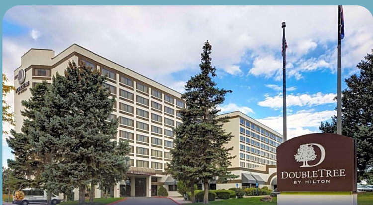
DOUBLETREE GRAND JUNCTION