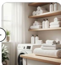
Concept & Mood