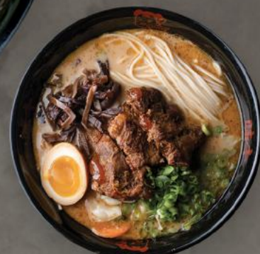
Paiku Ramen (tender pork ribs) 14.50