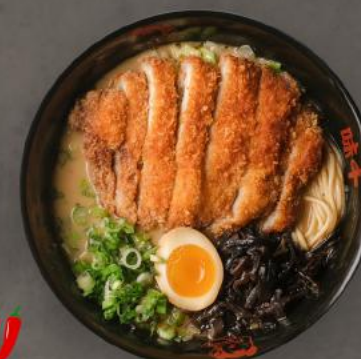
Tonkatsu Ramen 14.25