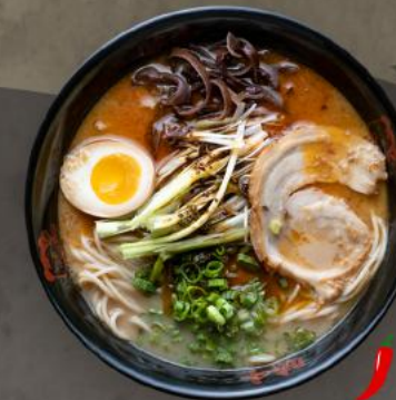
Negi Ramen 10.75