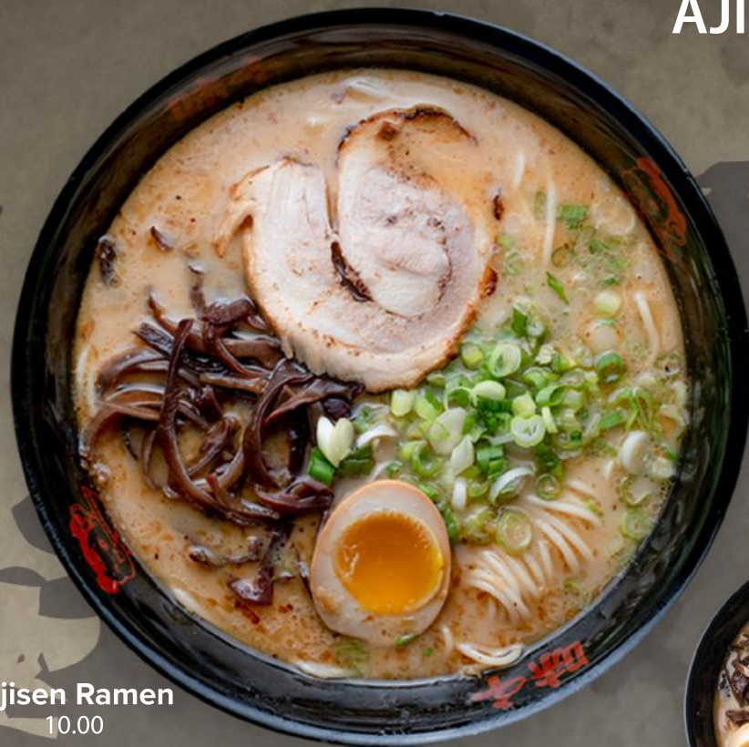
Ajisen Ramen 10.00

AJISEN RAMEN. Taste of Kyushu. Originated in Kumamoto. Ramen of the World.