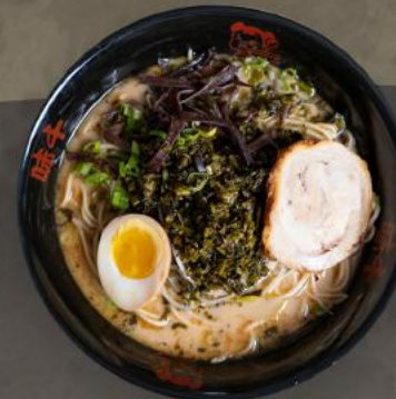
Takana Ramen (pickled mustard leaves) 11.75