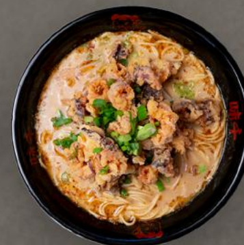
Crispy Calamari Ramen 11.50