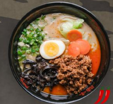
Spicy Ramen (spicy ground pork) 10.95