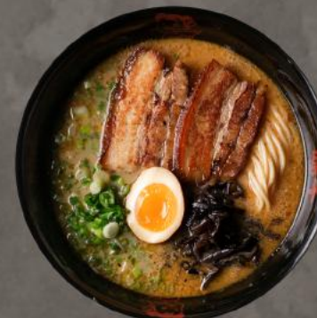
Old Fashion Ajisen Ramen 11.25