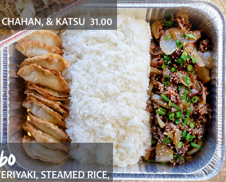
teriyaki combo BEEF OR CHICKEN TERIYAKI, STEAMED RICE, KANI SALAD, & GYOZA 43.00