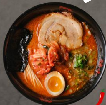
Kimchee Ramen 10.95