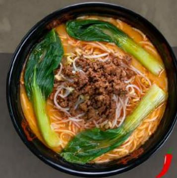
Tantan Ramen 11.25