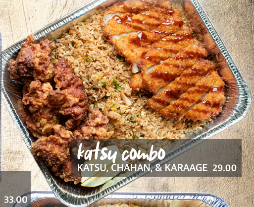
katsy combo KATSU, CHAHAN, & KARAAGE 29.00