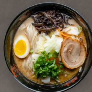
Yasai Ramen 10.75