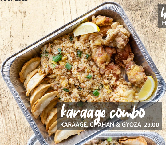
karaage combo KARAAGE, CHAHAN & GYOZA 29.00