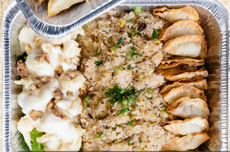
honey walnut shrimp combo HONEY WALNUT SHRIMP, CHAHAN, & GYOZA 33.00