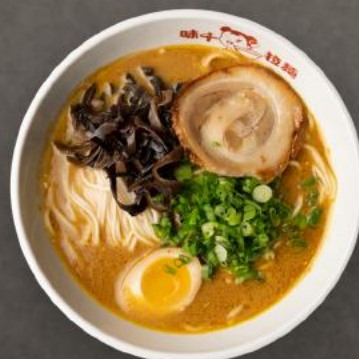
Curry Ramen 10.50