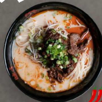
Ma-la Beef Ramen 12.50