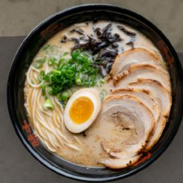
Chashu Ramen 14.25