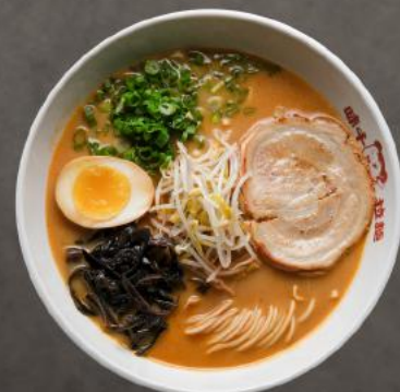
Miso Ramen 10.95