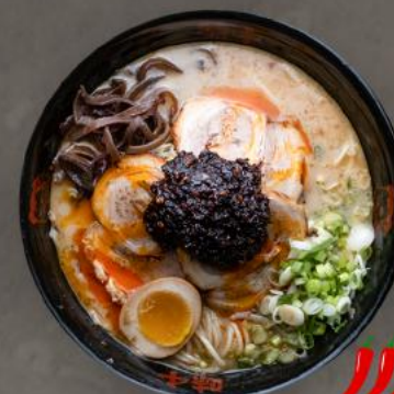
Volcano Ramen 13.75