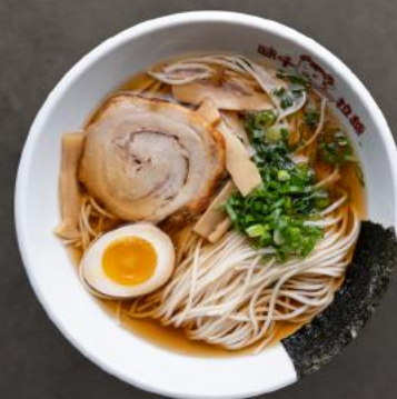
Shoyu Ramen 9.50