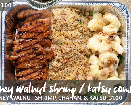
honey walnut shrimp / katsy combo HONEY WALNUT SHRIMP, CHAHAN, & KATSU 31.00