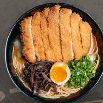
Tonkatsu Curry Ramen 14.50