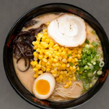
Corn Ramen 10.75