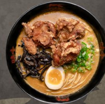
Karaage Curry Ramen 14.50