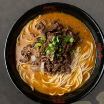
Beef Curry Ramen 11.50