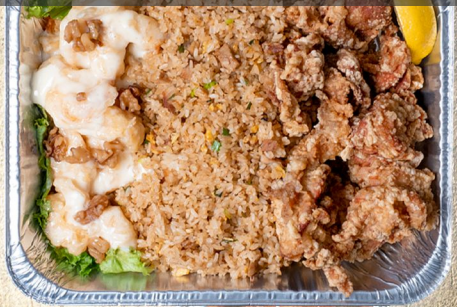
honey walnut shrimp/karaage combo HONEY WALNUT SHRIMP, CHAHAN, & KARAAGE 35.00