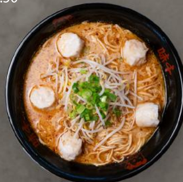
Shrimp Shumai Ramen 12.25