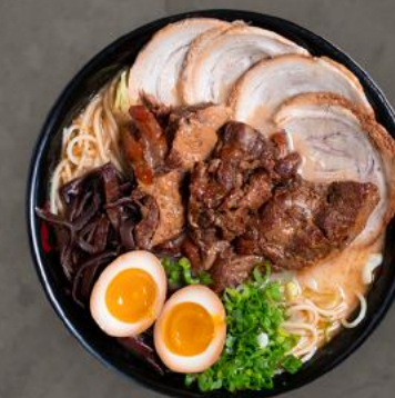
Zen Nose Ramen 17.25