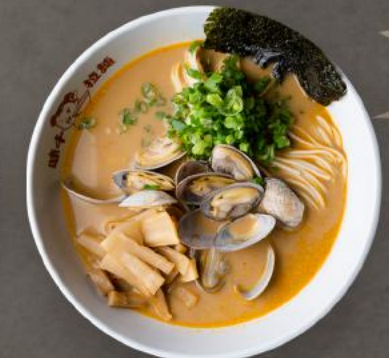
Clam Ramen 12.50