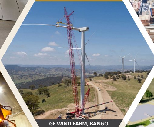
GE WIND FARM, BANGO