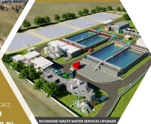
RICHMOND WASTE WATER SERVICES UPGRADE

For more information, please contact: Conrad Winter: 0409 790 011 conrad.winter@archservices.com.au