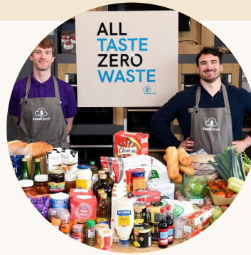
Work with Surplus Food