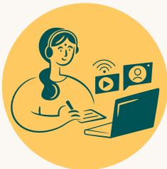
upskilling & training opportunities