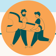
support its projects in their community.

Limerick Island Community Partners has built its vision around the community – programmes and projects for the community, by the community. For this to work, the community needs to believe in what the organisation does. It is important that people: