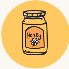
bee keeping & honey production