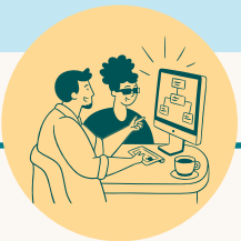
use the organisation's services