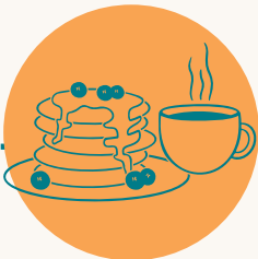
a community café with breakfast programmes