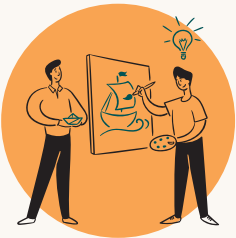
providers of art classes