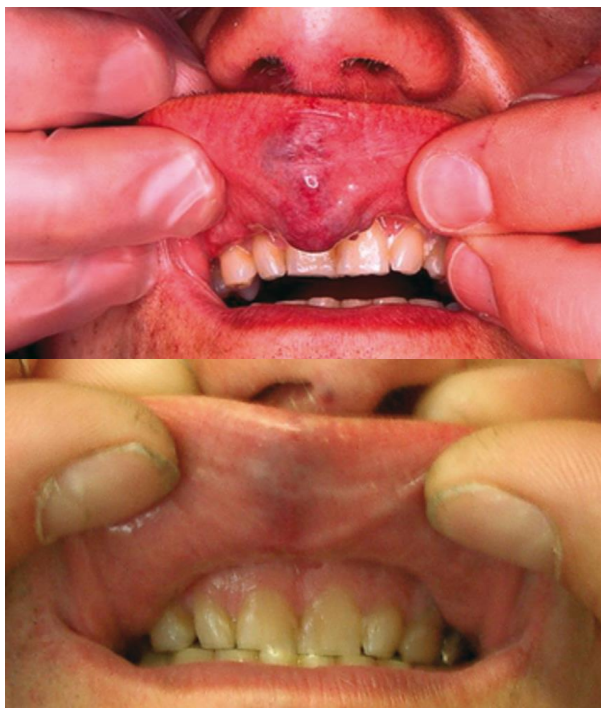
Photographs of a venous malformation of the labial mucosa treated by a laser session.

These techniques are not always offered, and when the venous malformation is not very bothersome or too difficult to access, we are content with simple monitoring.