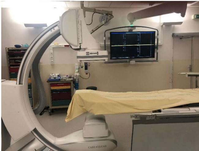
Photograph of the operating room: the patient lies on the table and the C-arm is positioned close to the area to be sclerosed so that the product can be seen in real time.