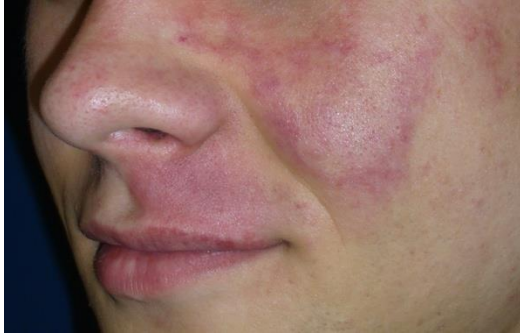
Photograph taken after a pulsed dye laser session on the central part of the capillary malformation.

In certain cases, such as significant tissue hypertrophy, the appearance of pyogenic granulomas or botriomycomas, surgical intervention may be proposed.