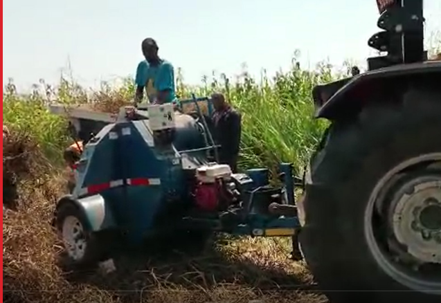
HFU-donated bean thresher in action – reducing threshing time and harvest loss.