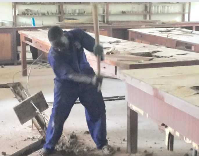
SHS Science Lab renovation – removing old gas lines buried in the floor.