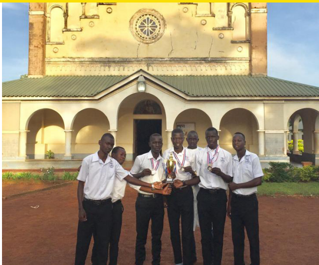
Congratulations to SHS debate team for winning a recent competition.

On July 30, 2022, thousands of the faithful gathered in the Archdiocese of Gulu to celebrate the ordination of 3 new priests and 8 new deacons at the Cathedral of St. Joseph in Gulu. Thank you for helping build up the Church in Uganda!