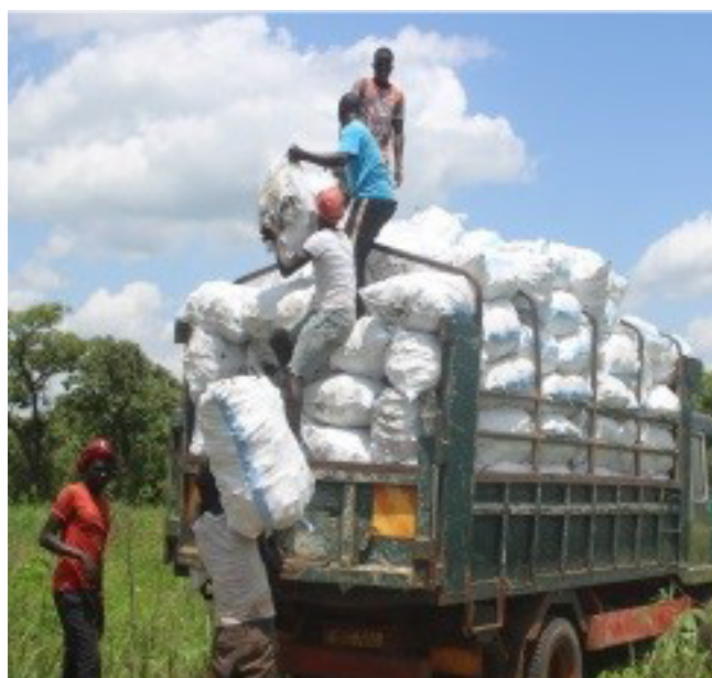
Harvested cassava roots loaded for sale to the community.