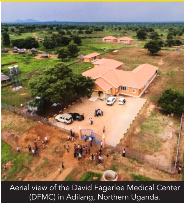
Aerial view of the David Fagerlee Medical Center (DFMC) in Adilang, Northern Uganda.