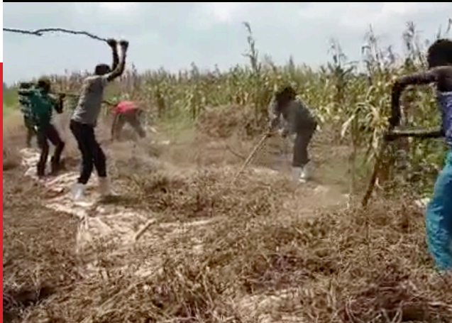
A portion of the bean crop being harvested the traditional way – beating pods off stalks.