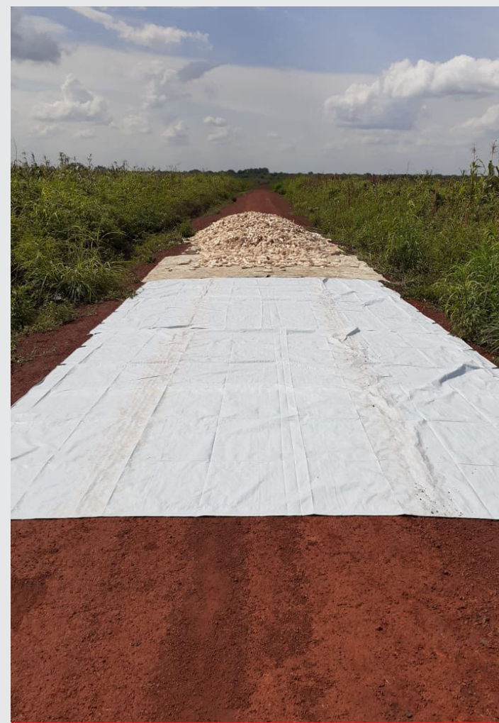
A successful corn crop requires the use of the new road due to no current drying facilities.