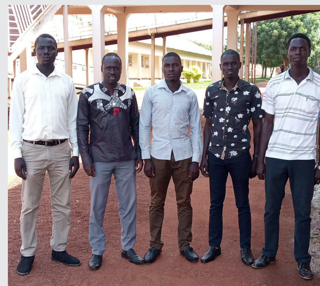
A few of the AFSS alumni who have returned to inspire the next generation of students.

The difficulties continue surrounding the new government-mandated curriculum. Without your support we are unable to meet the need to equip all students with wireless internet, giving them access to global learning materials. We are very concerned about our students falling behind and what the ramifications of that would be, both in terms of their education and the government's involvement.