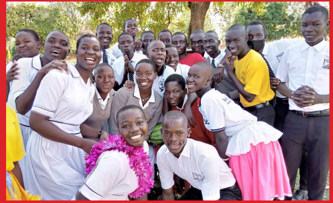
Students are excited to be back on campus with friends and they are ready to learn.