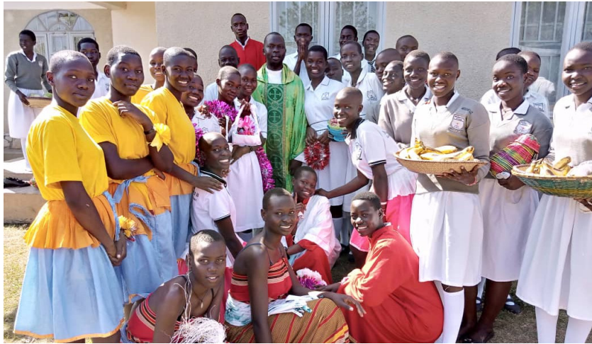
Students praise and worship God at Mass of thanksgiving to start the new school year.