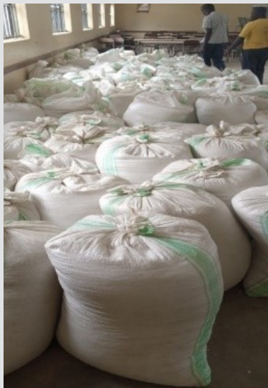
Left: A bountiful 2021 harvest leads to the need for creative storage of corn in AFSS dining room. Right: Farm grown sunflowers made into cooking oil & presented to Msgr. Matthew and Archbishop Odama.