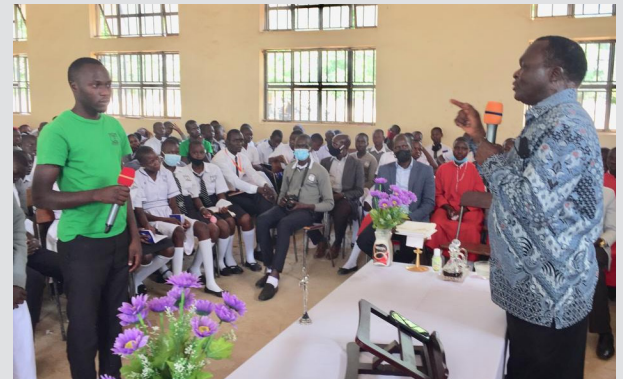
Uganda Supreme Court Chief Justice – Alfonse Chigamoy Owiny-Dollo - offers an encouraging message for AFSS students. (March 13, 2022)