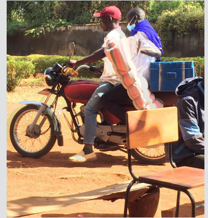
Hundreds of seminarians arrive at SHS for registration.