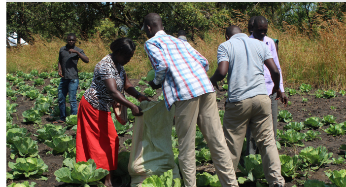
AFSS staff picking cabbages to feed students