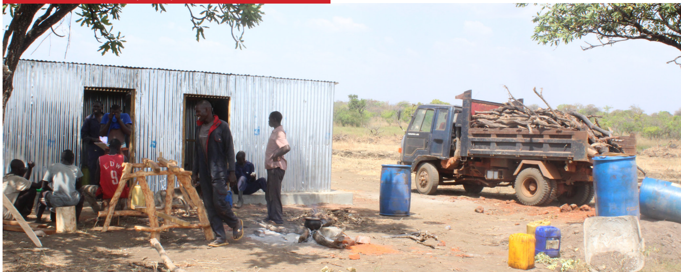
Locals rest after constructing temporary shelter at The Farm