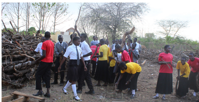
AFSS students pile up wood for cooking

Because of hard work and the generosity of HFU benefactors, sustainability through agriculture at AFSS is a becoming a reality. Please pray for its continued success and the well-being of the farm staff and workers as they labor with your love in their hearts.