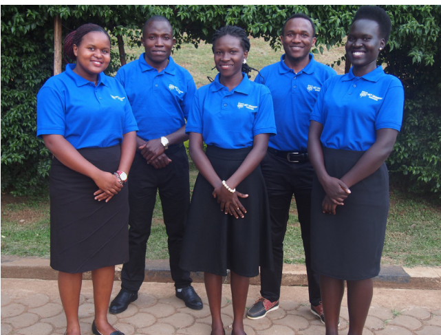
Above: NET Ministries-Uganda will visit AFSS

WE SEE THE SPIRIT MOVING – I'm excited to announce a new collaborative relationship between AFSS and NET Ministries. A local Uganda team of five young adult NET leaders will conduct two inspiring and interactive spiritual retreats in 2019. AFSS alumni will also be invited to attend a NET evangelization training program in June. The Holy Spirit is certainly working among us!