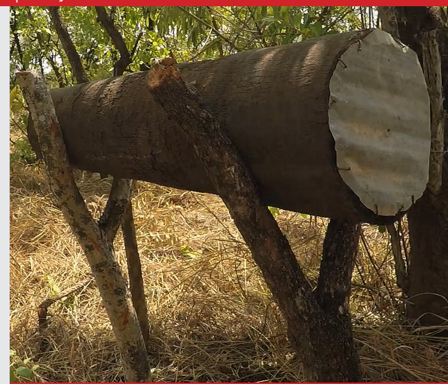
Traditional style bee hive installed at The Farm