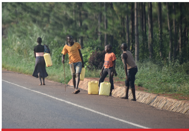
Ugandans travelling along road to fetch water

This was even more obvious in my conversations with students from Sacred Heart Seminary and Archbishop Flynn Secondary School. They take education very seriously and recognize the sacrificial giving of the benefactors who have provided this