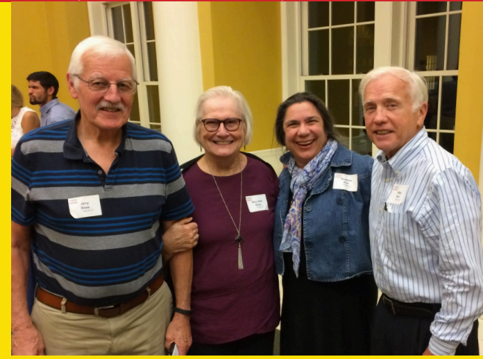
The Birds and the Biese.