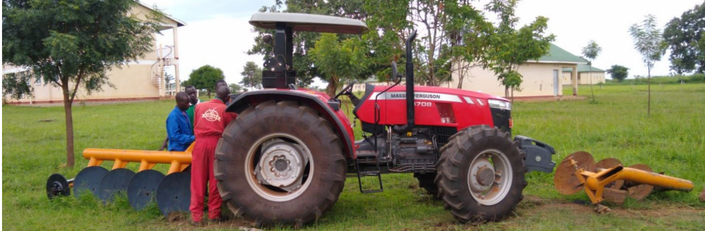
Above: Farm Challenge Grant plus donation match funds purchase of new tractor, plow and disc.

Thank you for supporting this now-proven effort towards sustainability at AFSS. From tractors and motorcycles, to land surveys and education, you are changing lives and transforming a nation! Our promise in return is to be the best possible stewards of our land. God has blessed all of us in creating something very good.