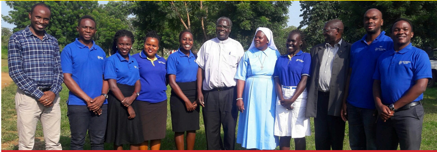
NET Ministries of Uganda leads a retreat for 30 AFSS Alumni