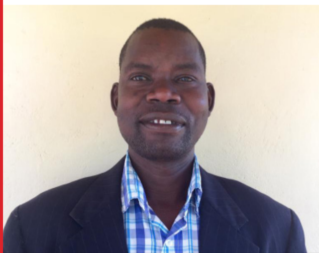
SHS graduate returns to form future Ugandan priests

I did not see it clearly then, but I knew God was nudging me in a different direction. Later, when I started university for a bachelor's degree in education with majors in history and religious studies, I felt I owed HOPE FOR UGANDA and Sacred Heart Seminary an enormous debt for giving me the foundation for becoming a respectable man. In gratitude, I decided to go back to the seminary as a teacher, where I have taught for the past 16 years. I am so happy to serve as a teacher, building and forming priests for the Gulu Ecclesiastical Province and the Universal Church.