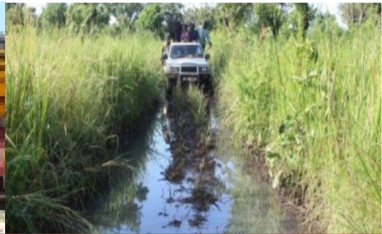
Navigating around the Farm is very difficult during rainy season

The greater glory goes to you, my friends and benefactors. To date, your generosity has: