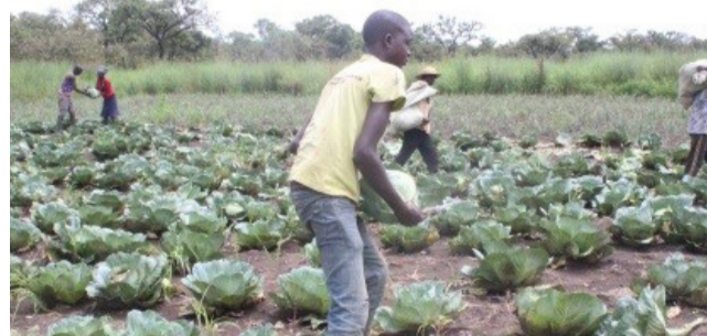
Cabbage being harvested to feed students and staff