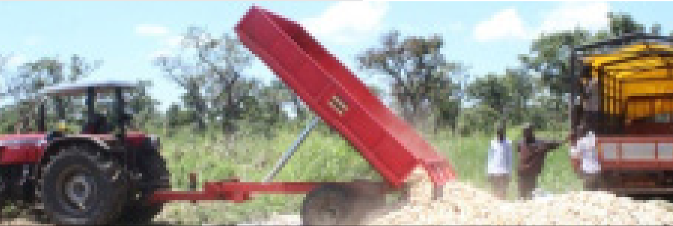
HFU-funded tractor and trailer are vital tools for transporting abundant corn production in 2020

Wishing you a Merry Christmas and prosperous New Year!