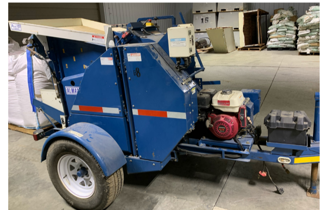
Thresher being sent to Uganda to improve efficiency and reduce crop loss during harvest

Today Ed and Debbie stand ready to share their wisdom and knowledge in support of the Farm, and are especially eager to assist with the development of future efforts to expand the concept of demonstration farming. They are in the process of donating a thresher that will soon be shipped to the Farm to assist with the harvesting of beans. This miracle machine will increase the speed of harvesting by ten times what it takes to manually accomplish the same process, as well as significantly reducing crop loss (see picture below). Ed is itching to introduce hybrid seeds, and ultimately add new products to the mix, while Debbie’s interest in nutrition is being tapped to help improve the nutritional balance in students’ diets. An example of this vision is to use corn as a staple for animals instead of people, providing more and better protein for the students. They are both eager to visit Uganda, their plans limited only by COVID-19.