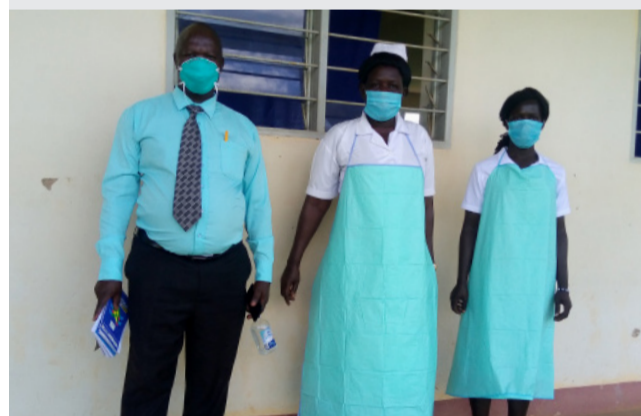
AFSS staff equipped to create a safe environment for students returning to campus