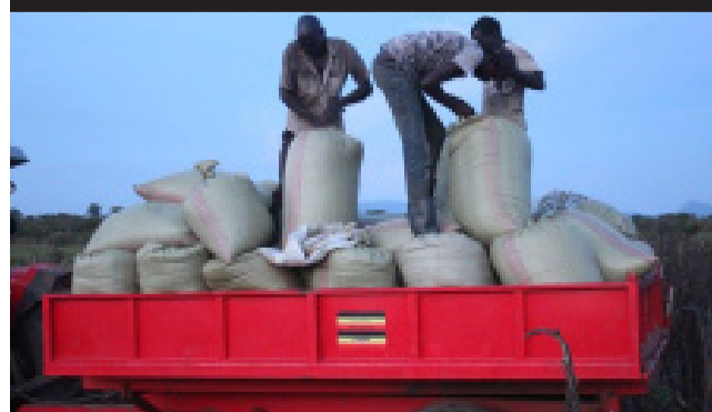
Crops being transported by HFU-funded tractor/trailer