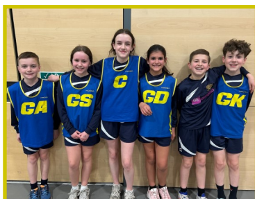
The school high-five netball team