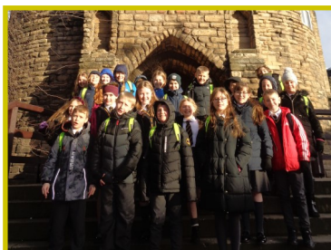
Year 5 at Newcastle Castle