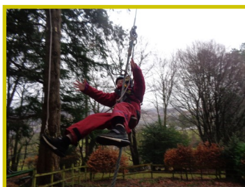
Taking on the 'Big Swing' challenge

The children also challenged themselves on a hill walk in the beautiful surrounding landscape, as well as orienteering, tackling the low ropes course and navigating the indoor climbing wall. Each group also took part in a night walk aimed at developing team-work and taking on the exciting challenge of the high ropes course proved to be a real highlight for many of the children. A huge thank you to everyone for ensuring that the time spent in Derwent Hill was a wonderful experience and that many great and lasting memories were made - a massive well done to everyone involved throughout the week.