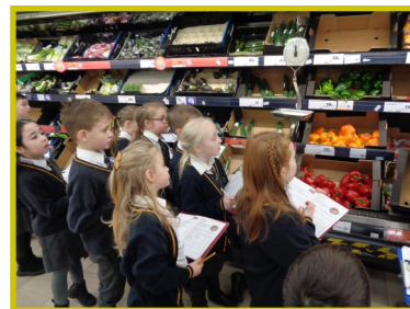
Year 2 problem solving at Sainsbury's

Reception visited Stowell Street in Newcastle, where they enjoyed studying the Chinese gate and visiting the supermarket to buy some food and decorations for a celebration back in school. The children also enjoyed sharing fortune cookies and reading the messages inside. The Reception children also went to the nearby Discovery Museum, where they took part in a variety of exciting challenges in the Science Maze.