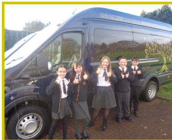
The brand new school minibuses

Bernard Gilpin Primary School recently invested in two brand-new minibuses to further enhance transport for educational visits and extra-curricular activities such as sporting events. The two state-of-the-art vehicles will provide an up-to-date, safe and comfortable travelling experience for all pupils, ensuring continued access to educational opportunities beyond the classroom. This upgrade reflects the school's commitment to enriching students' learning experiences and further strengthening community engagement.