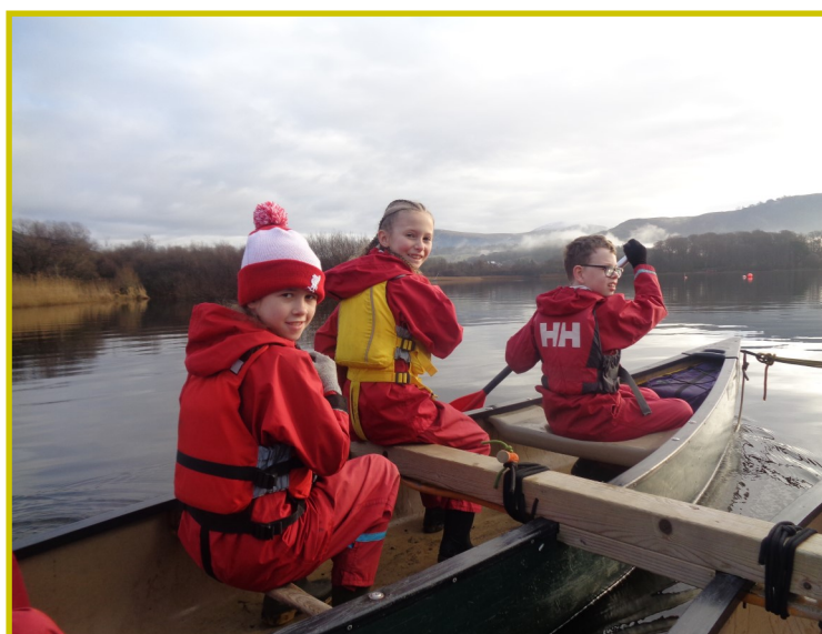
A group canoeing towards One Tree Island on the tranquil Derwent Water

The children also challenged themselves on a hill walk in the beautiful surrounding landscape, as well as orienteering, tackling the low ropes course and navigating the indoor climbing wall. Each group also took part in a night walk aimed at developing team-work and taking on the exciting challenge of the high ropes course proved to be a real highlight for many of the children. A huge thank you to everyone for ensuring that the time spent in Derwent Hill was a wonderful experience and that many great and lasting memories were made - a massive well done to everyone involved throughout the week.