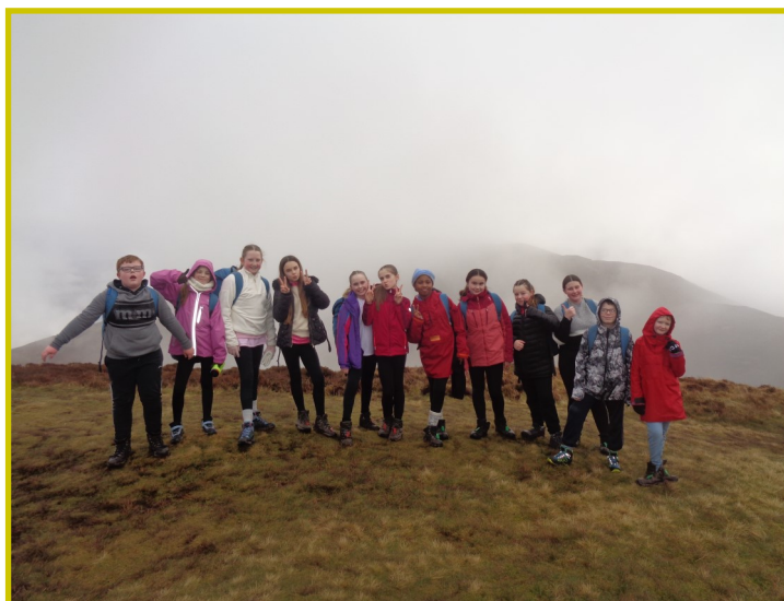
A group taking a moment to enjoy the views at the top of their hill climb

Children from Years 5 and 6 recently returned from a fantastic residential visit to the Derwent Hill Outdoor Education Centre. This excellent opportunity enabled the children to further develop their independence, resilience and respect for the environment in the heart of the stunning Lake District. Everyone involved had an action-packed week, with all of the groups taking part in a rotation of outdoor adventurous activities. Some of the many highlights for the children included canoeing to an island on Derwent Water, gorge walking, finding the courage to take on the challenge of the 'Big Swing' and toasting marshmallows on a campfire which they had built themselves using bush craft skills.