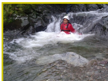
Braving the waterfall whilst gorge walking