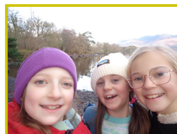
Big Smiles all round at Derwent Hill