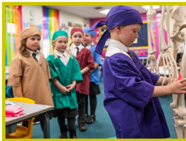
Year 1 taking part in the NHS Scrubs project