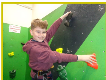
Navigating the indoor climbing wall