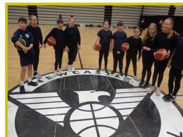
Year 6 at The Virtu Motors Arena