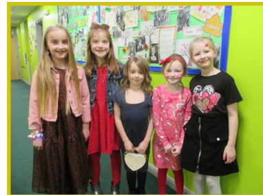
All smiles for the Valentine's Disco