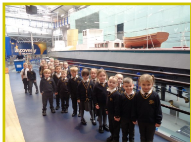
Reception at the Discovery Museum in Newcastle