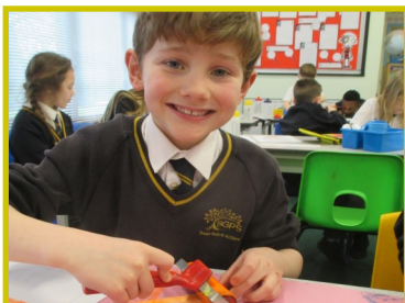
Year 3 creating and using printing blocks

Year 6 visited the state-of-the-art facilities at the Virtu Motors Arena in Newcastle, home to the Newcastle Eagles professional basketball teams. The children thoroughly enjoyed taking part in a range of STEM related learning activities, all delivered by two of the Eagles women's team. The highlight for the children was being on the main court, where they practised shooting before calculating their percentage of successful shots made. Year 6 also visited SafetyWorks! in Newcastle, where they participated in a number of real-life scenarios aimed at developing personal safety.