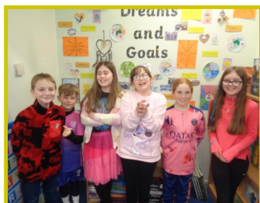
Red and Pink for British Heart Foundation

On Friday 14th February, the school had a non-uniform day to raise money for The British Heart Foundation, a charity working to support people living with heart conditions, providing funding for research, and campaigning to raise awareness. As well as wearing red and heart-themed clothing, the children learnt more about the work of the charity and how they help people across the UK. Well done to everyone involved for their efforts and for the generous donations received towards this great cause.