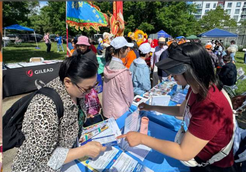
Community Outreach and Resources