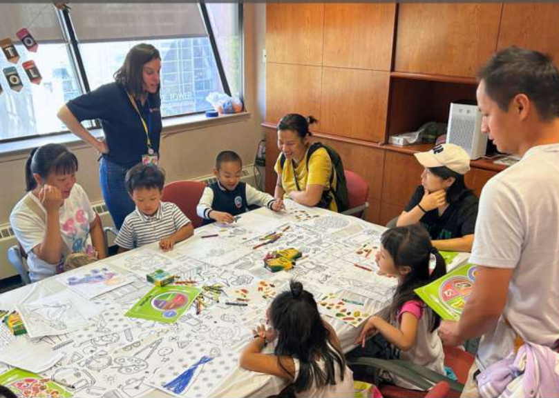
Read Aloud Event with Pediatrics Dept