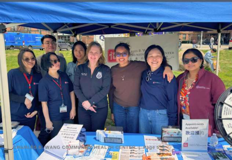
Spring Family Day