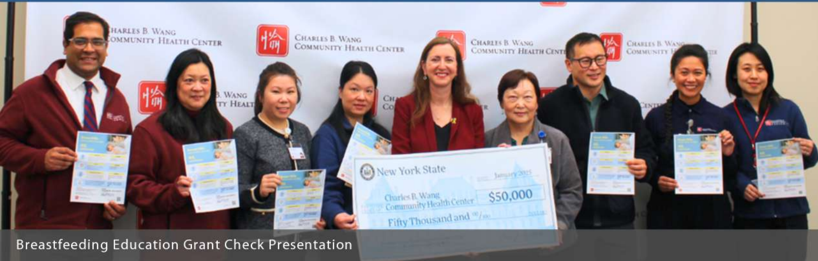
Breastfeeding Education Grant Check Presentation