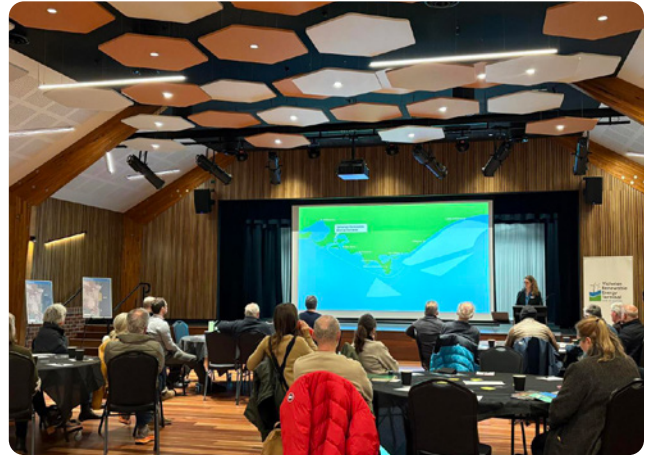
Image: Community Technical Roundtable session

Comprehensive bird studies have been carried out to understand existing behaviours, roosting areas and foraging patterns across the project area.