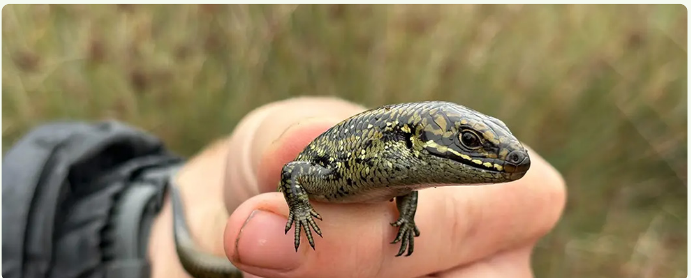
Image: Surveying Swamp Skinks ( Lissolepis coventryi ) as part of Onshore Ecology assessments.