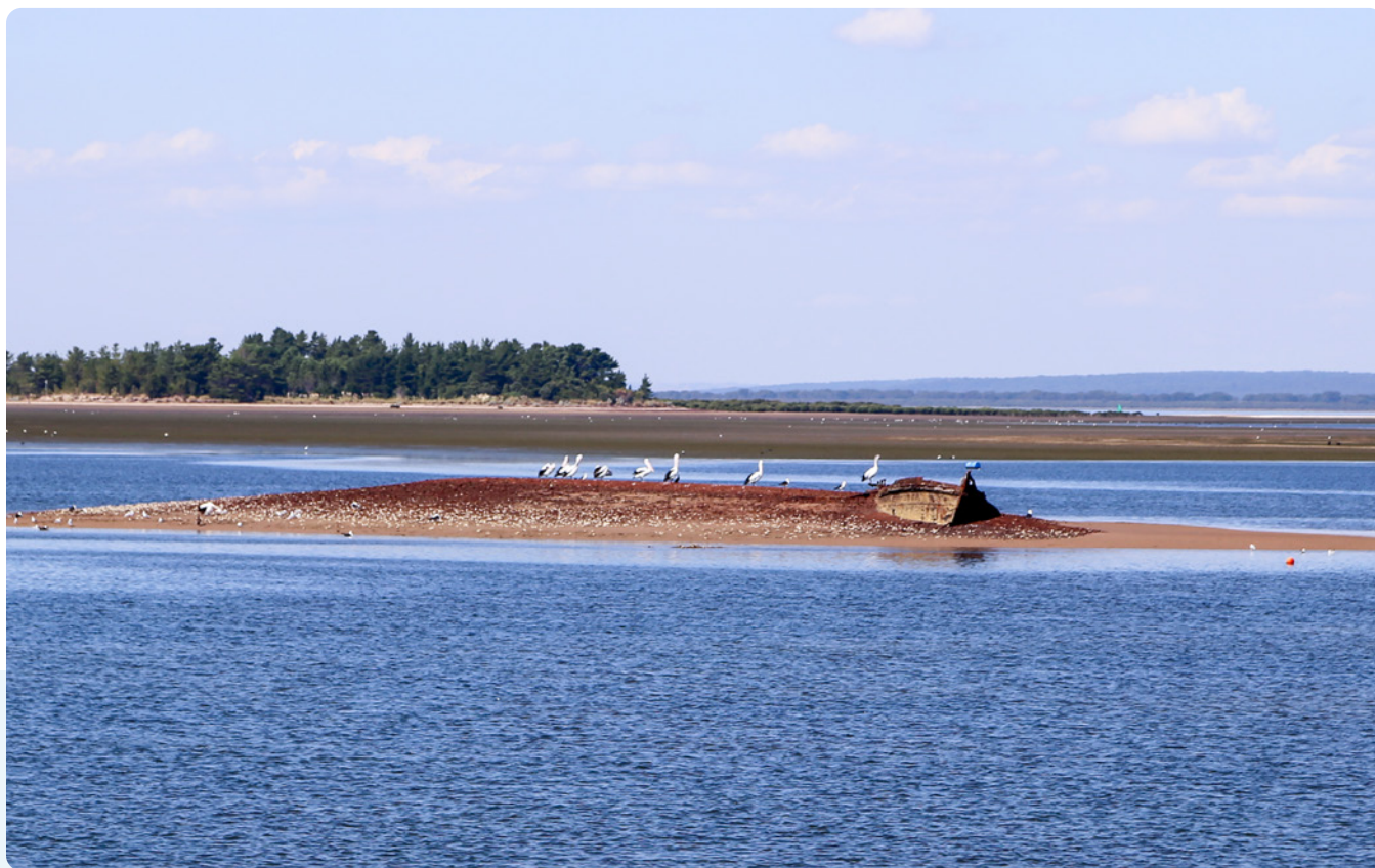
Image: Various waterbird species in Western Port.

One unexpected finding from the tracking study was that multiple Red-necked stints repeatedly travelled to the Eastern Treatment Plant in Carrum Downs for nocturnal roosting.