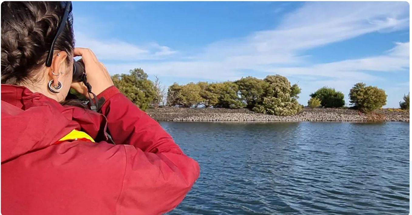
Image: Surveying birds as part of Waterbirds assessments.