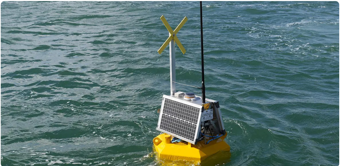
Image: Example of water quality monitoring buoy deployed in Western Port