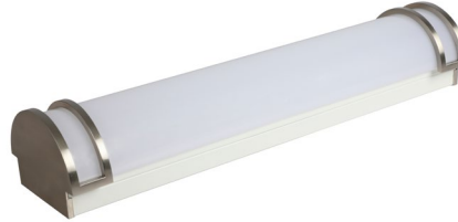
Brushed Nickel Bezel & Frosted Plastic Lens