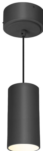
Black Housing with Black Reflector