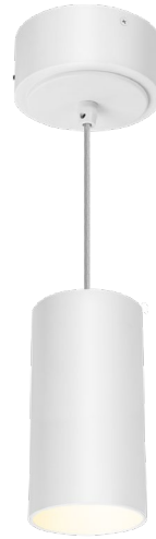
White Housing with White Reflector