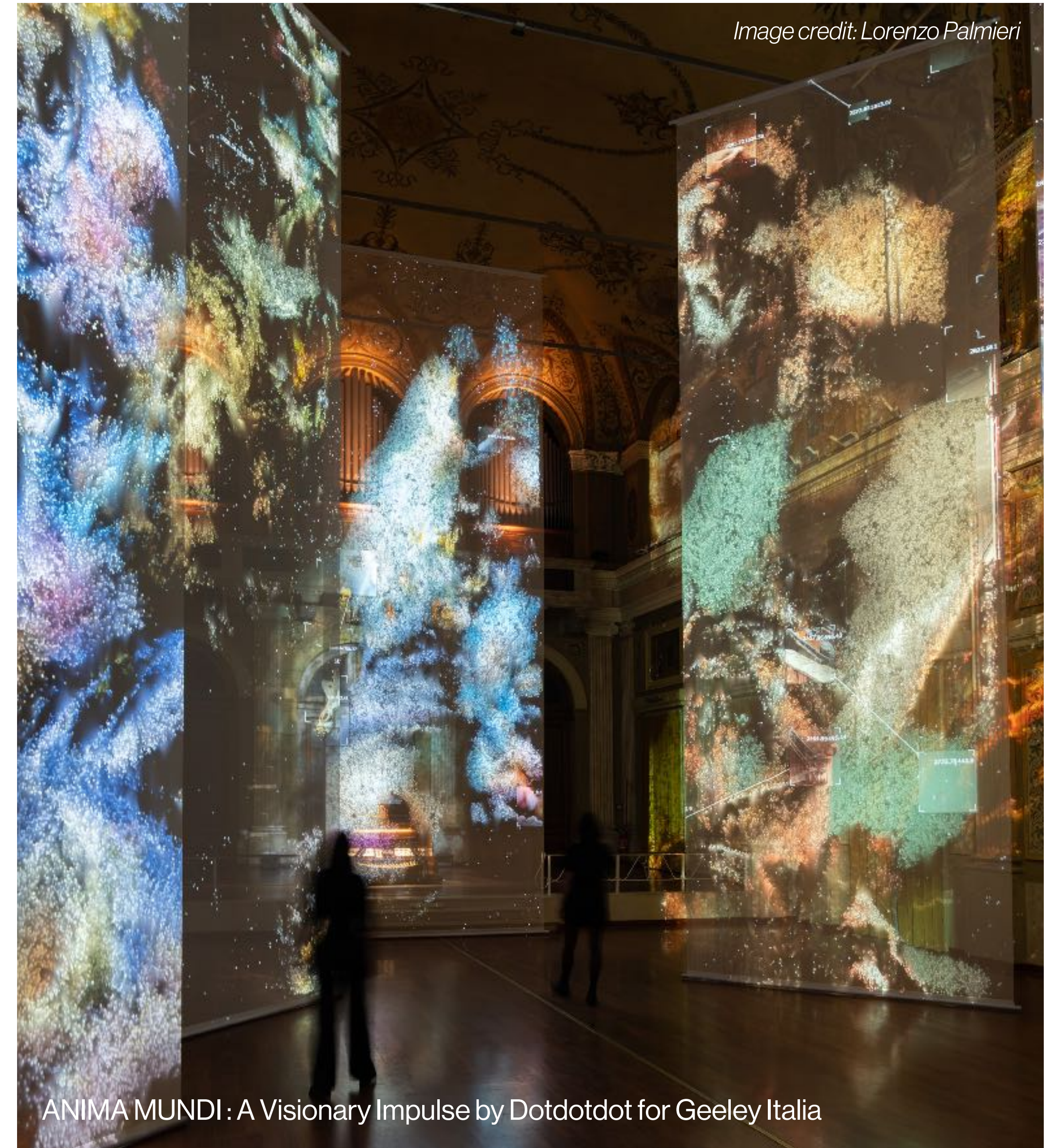
ANIMA MUNDI : A Visionary Impulse by Dotdotdot for Geeley Italia