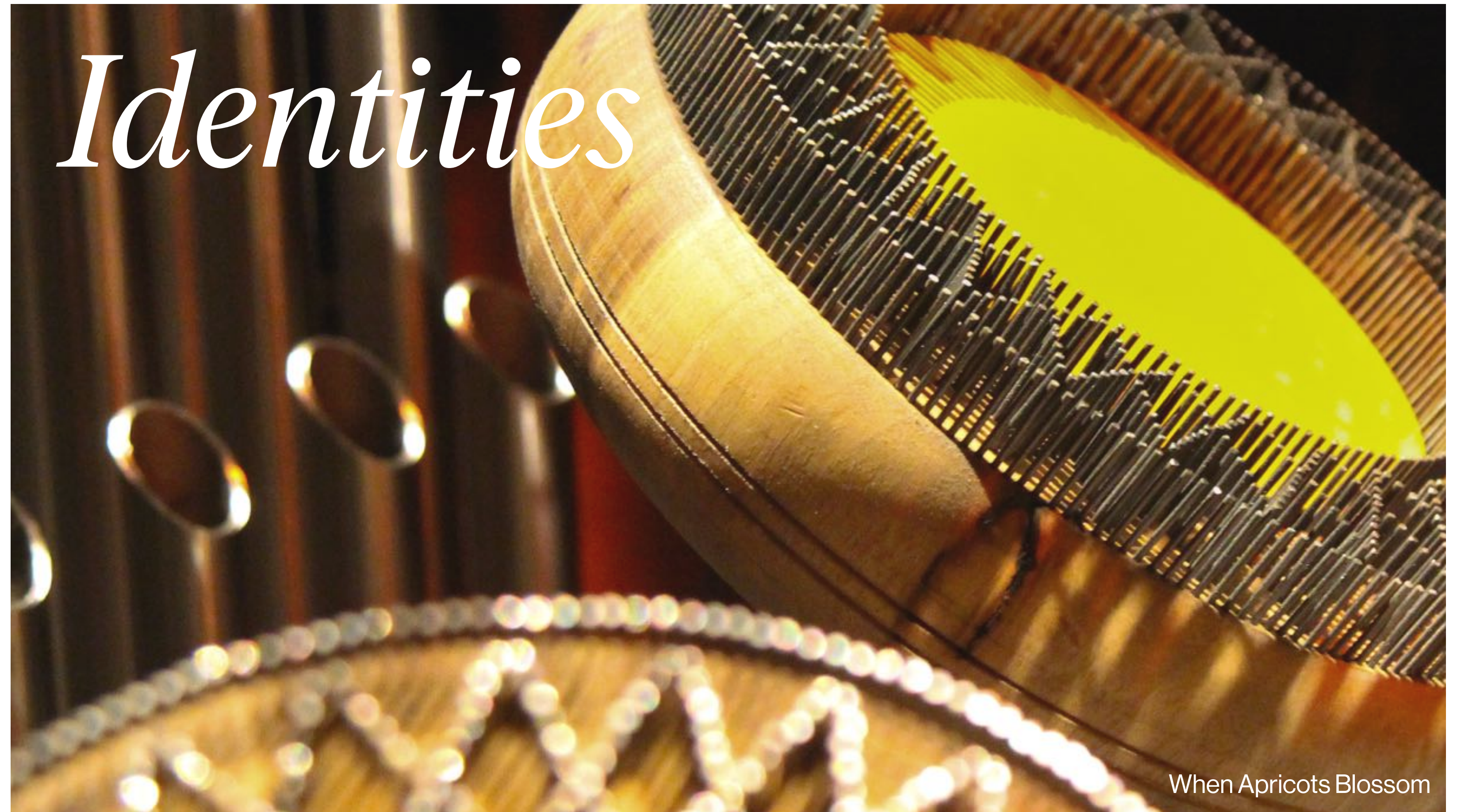
When Apricots Blossom

Identity is being reconsidered, not as something fixed or defined, but as something slowly constructed through time. At Milan Design Week, this emerged through a renewed focus on craft, not as nostalgia, but as a way of embedding meaning, knowledge, and authorship into what's made.