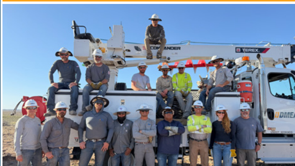
The utility crew with a couple who now have power.