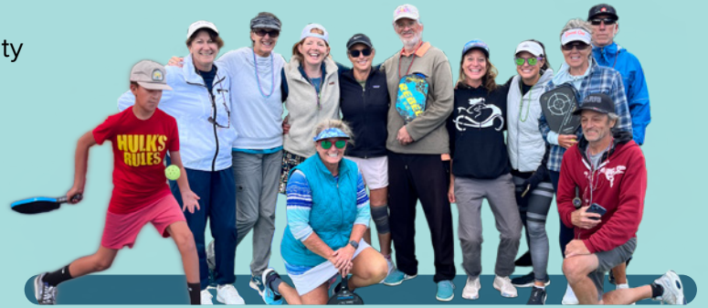
A few of the regular North Fork Pickleball players.

The North Fork Pickleball Club (NFPC) is planning and developing eight dedicated pickleball courts and four dedicated tennis courts at the Delta County Fairgrounds. These courts will host clinics, tournaments, and serve new and experienced players in the area. The new tennis courts will also become the home courts for North Fork High School tennis team. The projected cost to build this community facility is estimated at $1 million.