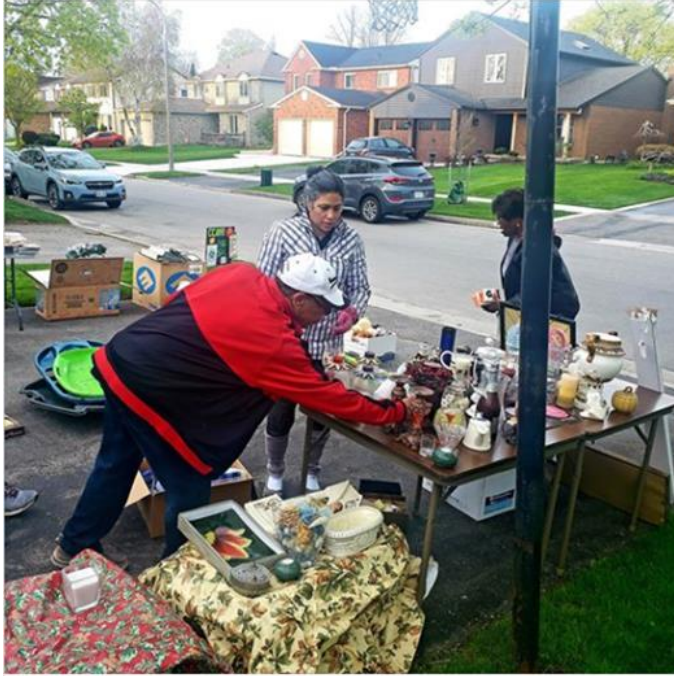
Hmmm....I wonder if this will sell?