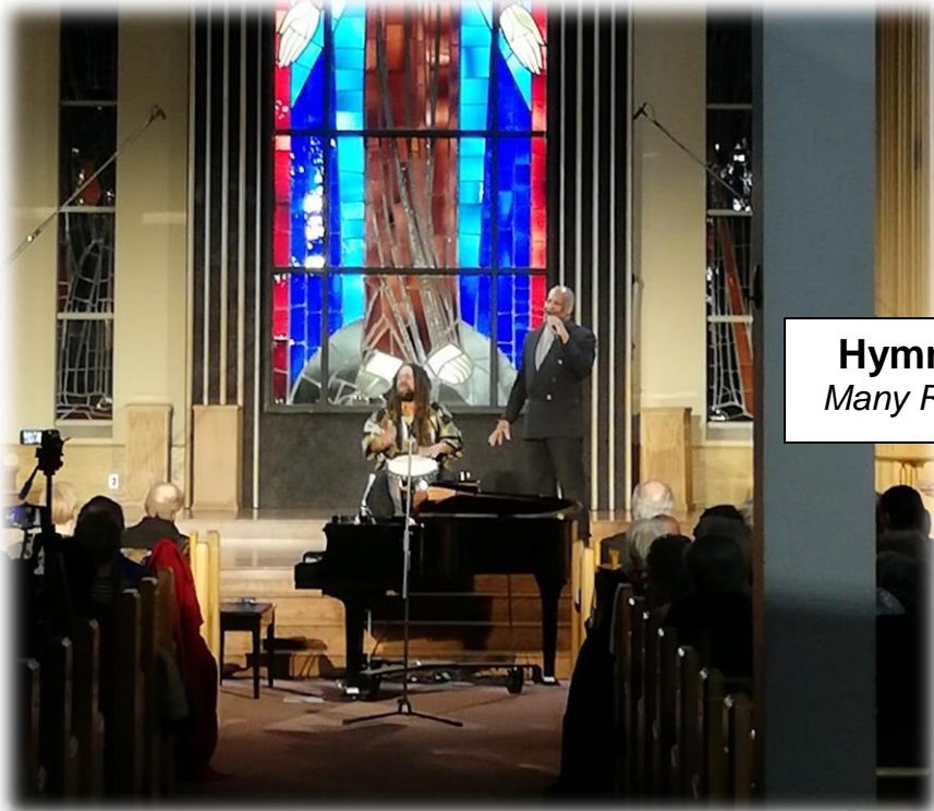
Hymn to Freedom – The Many Roads to Freedom Event