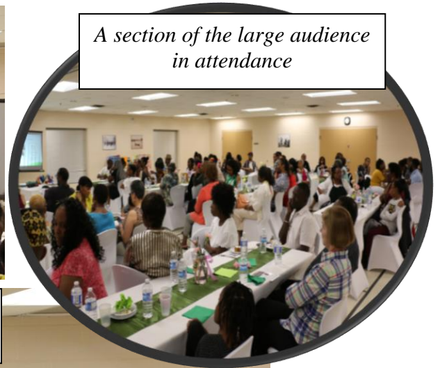
A section of the large audience in attendance