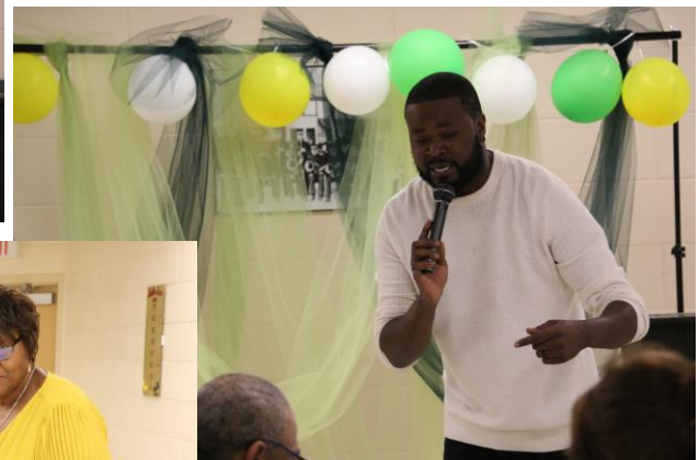
“Can’t wait to get my hand on some of that sumptuous looking food!!”