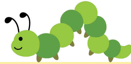
TK for Families