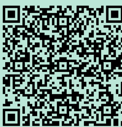
CDSS Child Care Programs