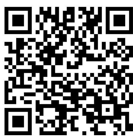
Family Decision Toolkit

For more information, scan the QR or click URL :