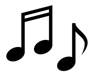
CSPP for Families