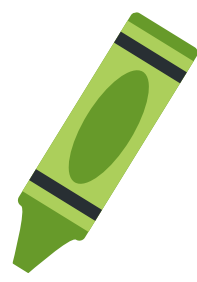
Subsidized Programs Overview