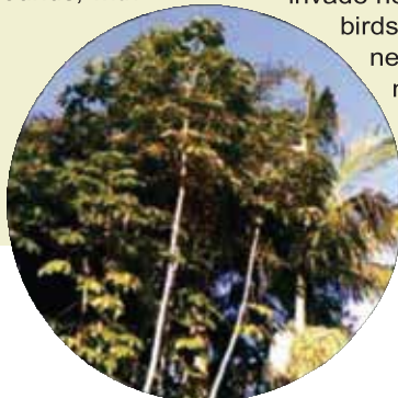
Exotic trees forming a typical Indian Myna roost site.

Mynas are well adapted to urban areas where feeding sites are plentiful. They are often seen resting on power lines, prowling schools grounds, picnic areas and sports fields for food scraps. They nest in gaps in city buildings, petrol stations, air conditioners, and in house roofs and gutters. In backyard gardens Mynas invade nest boxes and displace native birds and animals. They feed on nectar and seed put out to attract native birds and particularly favour left-over pet food.